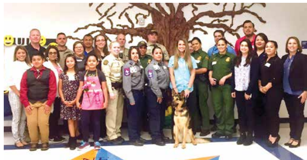
Garfield Elementary had many community visitors showcasing their careers to encourage students to think about their future. Pictured here are the community participants with the student council and administration team.