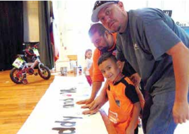
Fathers and other significant male figures gathered at Cardwell to learn about the importance of engaging in their children's lives and being a source of support and guidance in their education. To remember this day, fathers and children created a hand-over-hand handprint art project, creating a masterpiece.