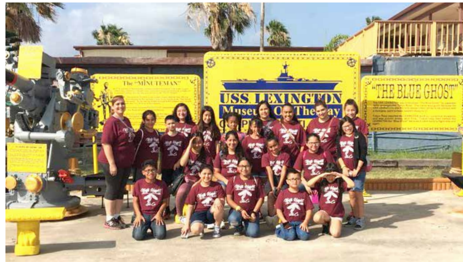
On June 1st and 2nd, North Heights Student Council took their end of year trip to San Antonio/Corpus Christi where they visited and sang to students at the Foundation for Autism Center. Autism awareness has been part of their leadership platform for two years. Students also got to learn about the history of the USS Lexington.