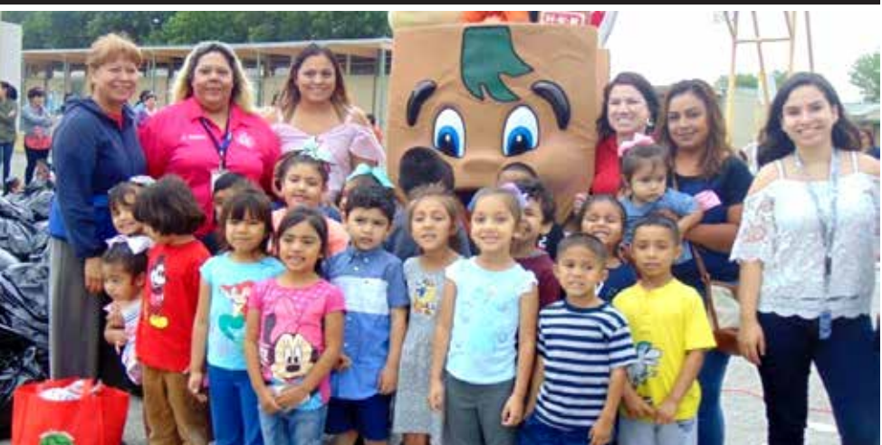
Cardwell students gathered over 107,000 plastic bags in one week winning the H.E.B. Regional Plastic Bag Challenge. Cardwell competed against school in Eagle Pass, Carrizo Springs, Pearsall, and Laredo. Go, Cubs!