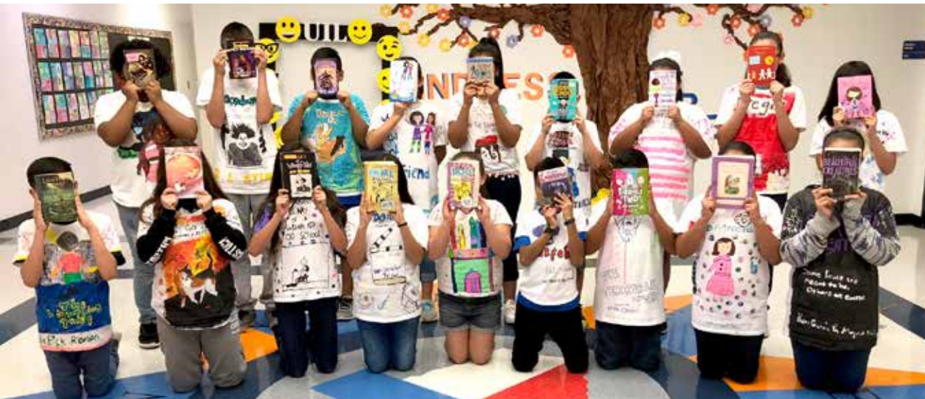
Fifth grade students from Garfield Elementary completed a t-shirt book report in which they were able to reinforce common core reading standards. The shirts included a replica of the book cover along with a well-written summary and all important aspects of the story (plot). The students presented their t-shirt reports to their peers and were allowed to wear them at school for other students and staff to enjoy!