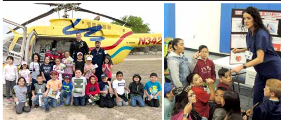
This year Buena Vista provided an exciting opportunity to share real-life experiences, professionals' knowledge, and all that it took to make successful professionals here in Del Rio. The purpose for having different local businesses come in was to help students build a connection between their education and their future career.