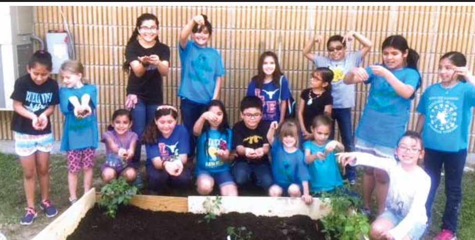
Buena Vista's Green Team has been growing their green thumbs! They planted a garden on Earth Day and have been helping the Tower Garden produce some amazing greens and herbs. Let's Go Green Together!