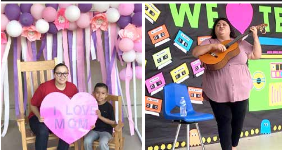
Mothers were serenaded at this year's Muffins for Mom, a Mother's Day event promoting parent engagement.