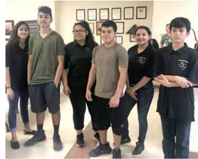
BASAA members volunteered at the Lions Club 5K Run fundraiser March 24, 2018.