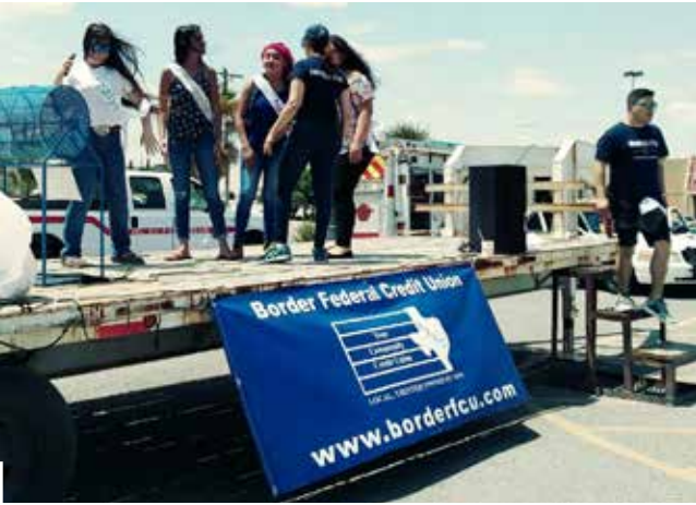
Blended BASAA members participated and helped at the BFCU Youth Fair April 28, 2018. They helped with the raffle, inflating and distributing balloons, and practiced public speaking skills.