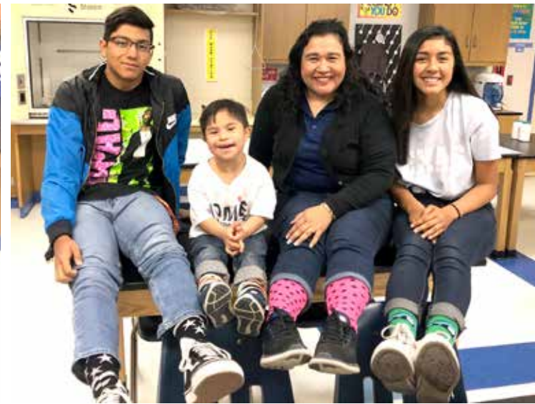
Del Rio High School students participated in World Down Syndrome Day on 3/21 by wearing their crazy socks to advocate for the rights, inclusion, and well-being of people with Down Syndrome.