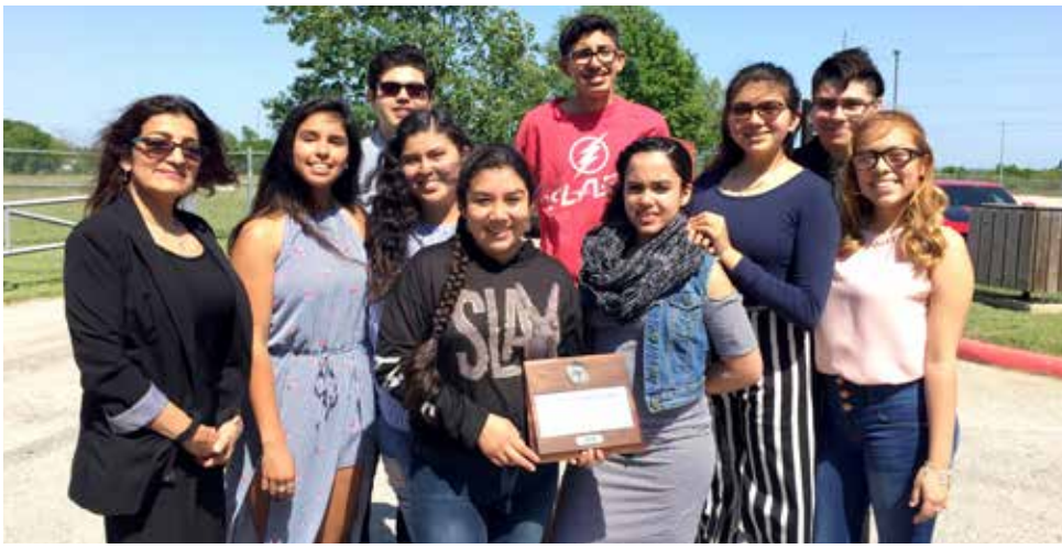
Del Rio High School Orchestra students participated in the UIL Concert and Sight-Reading contest in San Antonio. They are proud to announce they got First Division in Sight-reading (first time ever for DRHS) and earned Second Division in Performance. CONGRATULATIONS TO ALL OF THEM!