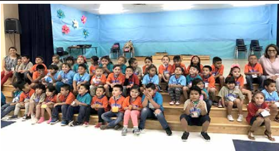
Cardwell Cubs were welcomed at their respective schools in preparation for upcoming kindergarten transition. They were given a tour of the school to meet teachers and become familiar with their new campuses.