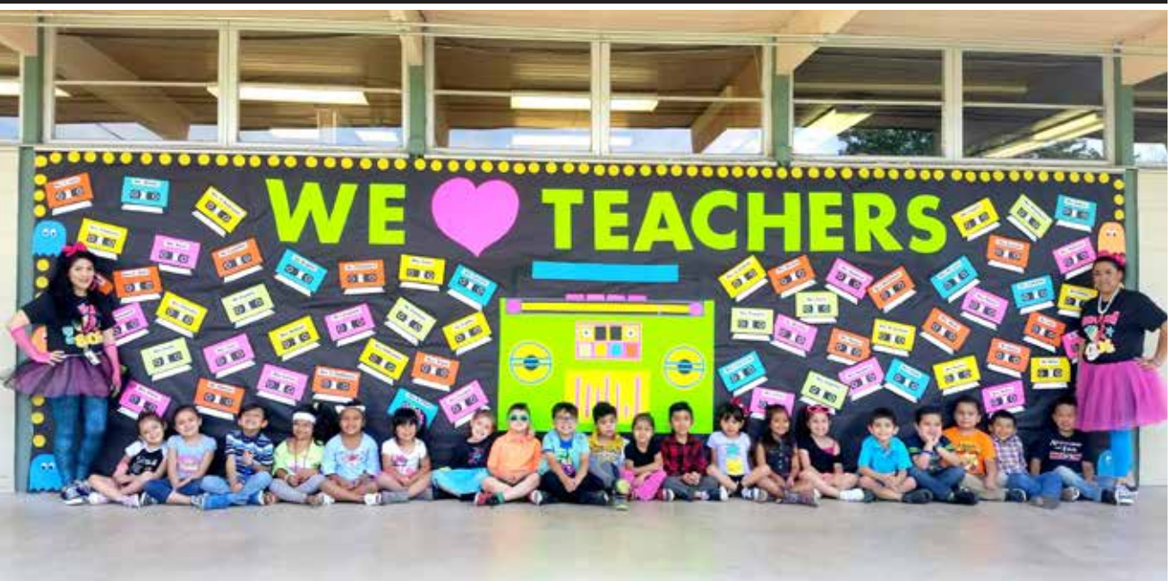
Students dressed up in 80's attire to show appreciation for their teachers during Teacher Appreciation Week.