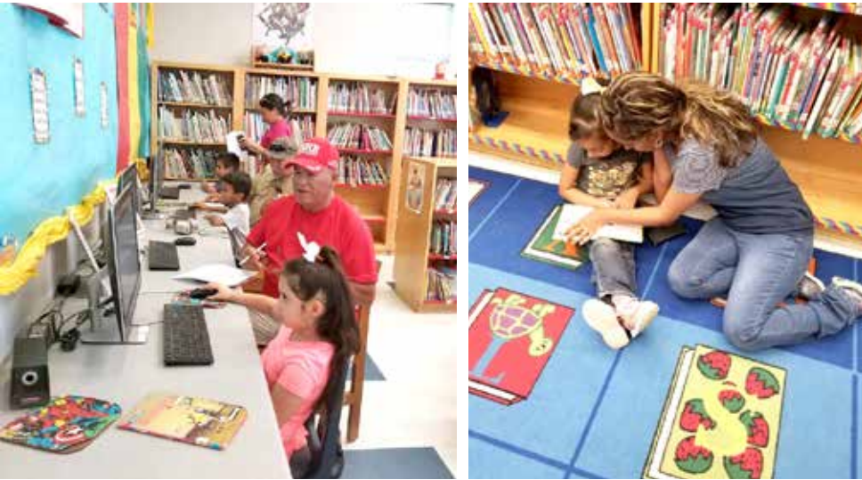
North Heights welcomed parents and students for our last AR Family Night – Joining us for a “Hot Dog Good Time”. We thank our parents for teaching your kids that reading is one of the most important skills anyone can have.