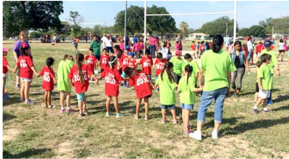
Students enjoyed field day events on the last week of school. Students were celebrated with popsicles, races and team events. Oh what fun it is to be an NHE Chief!