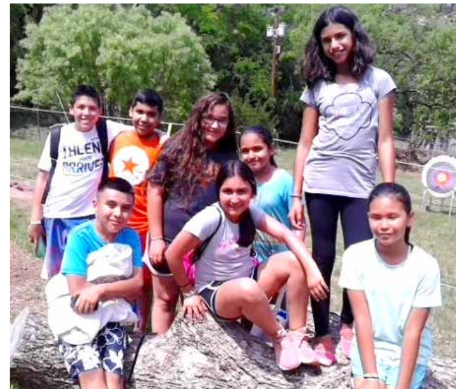
Garfield 5th graders attended MO Ranch in early May and learned about archery, reptiles, Ropes Course, and many other outdoor educational activities.