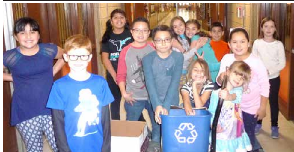
The Buena Vista beautification sessions put together by the STUCO were a way for students to gain insight and perspective as to how to be an active member in their school. Parents, students, and staff helped clean, paint and plant plants to beautify BV. The Student Council started at the Buena Vista Park and cleaned up the road that leads back to school.