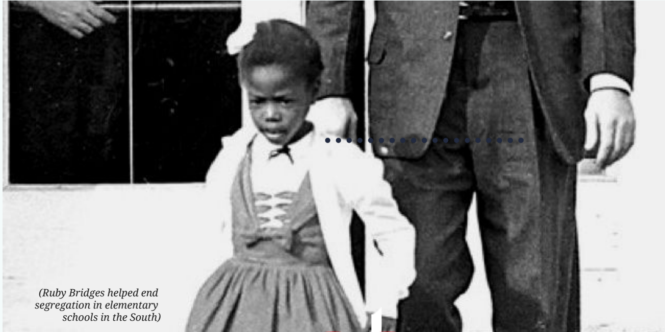
(Ruby Bridges helped end segregation in elementary schools in the South)