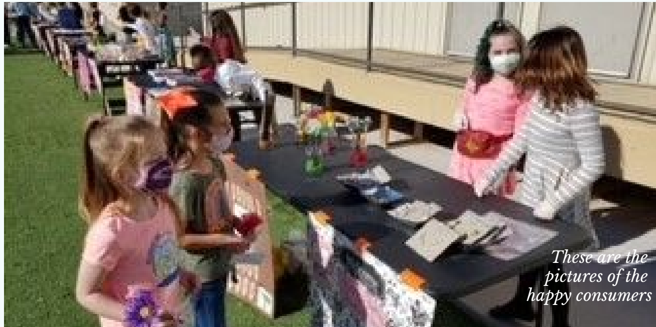
These are the pictures of the happy consumers

If you were absent on February 5th, you might not know how it was to be there and exchange your money for a item that you like.