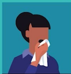
Cough, shortness of breath, or difficulty breathing

Know the symptoms of COVID-19 , which can include the following: