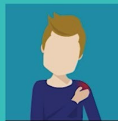
Muscle or body aches