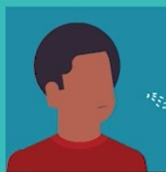
New loss of taste or smell