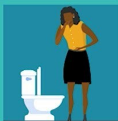
Vomiting or diarrhea