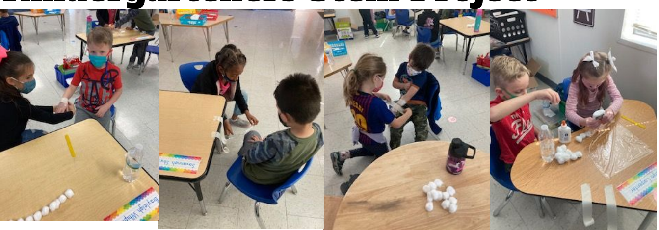
Words By: Brynnlee Bingham