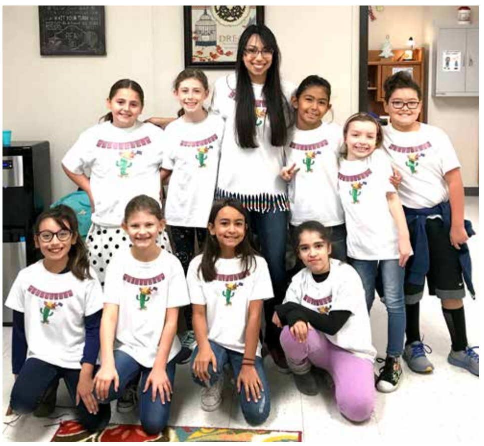
The UIL Ready Writing Team for 2018, heading off to compete at the District UIL Meet on Dec. 5th.