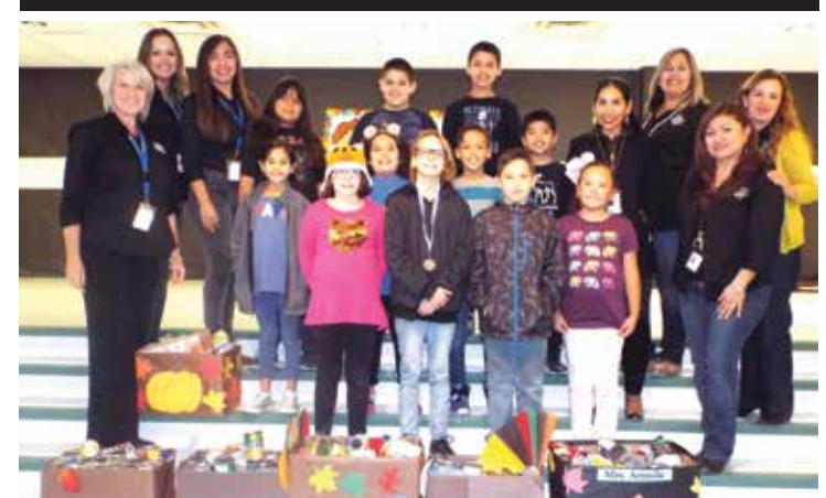
those in need this Thanksgiving.