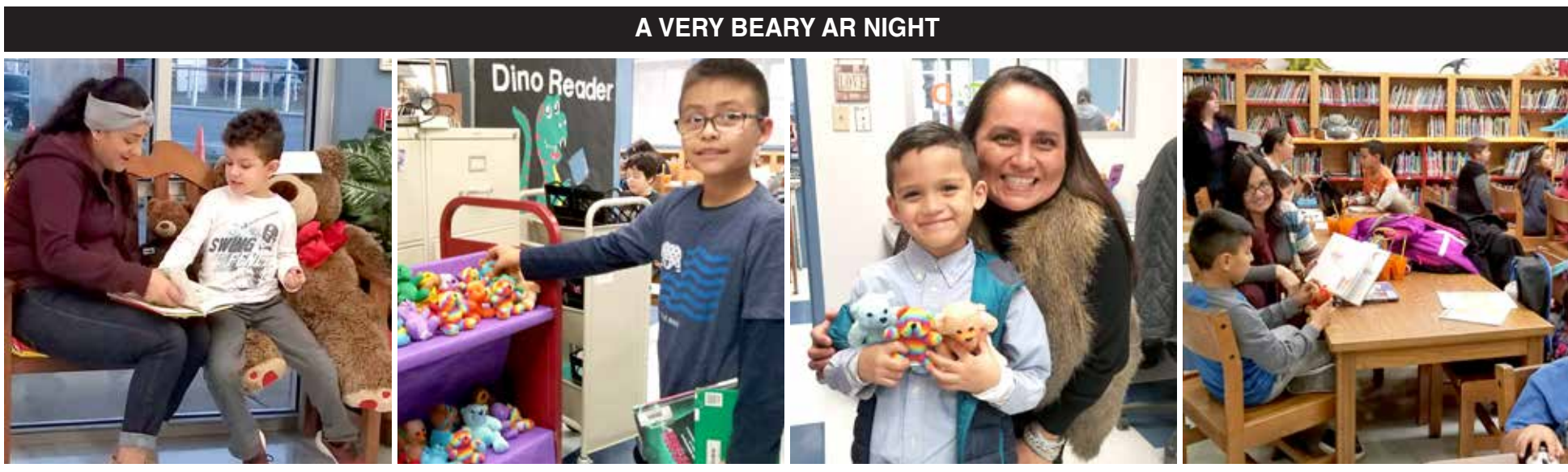
A Very Beary AR Night-Students received a cute cuddling bear while visiting the NHE library to read great books and to AR test on them.