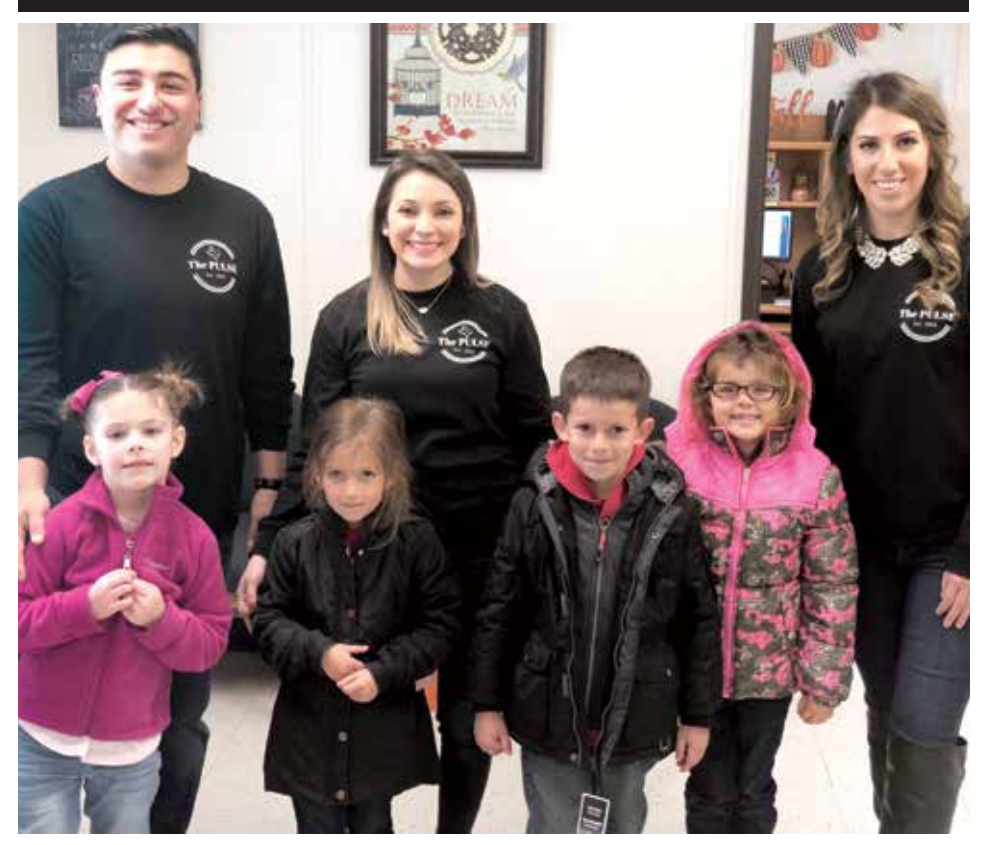
Border Federal Credit Union visited Laughlin Elementary and presented a few of our students with coats.