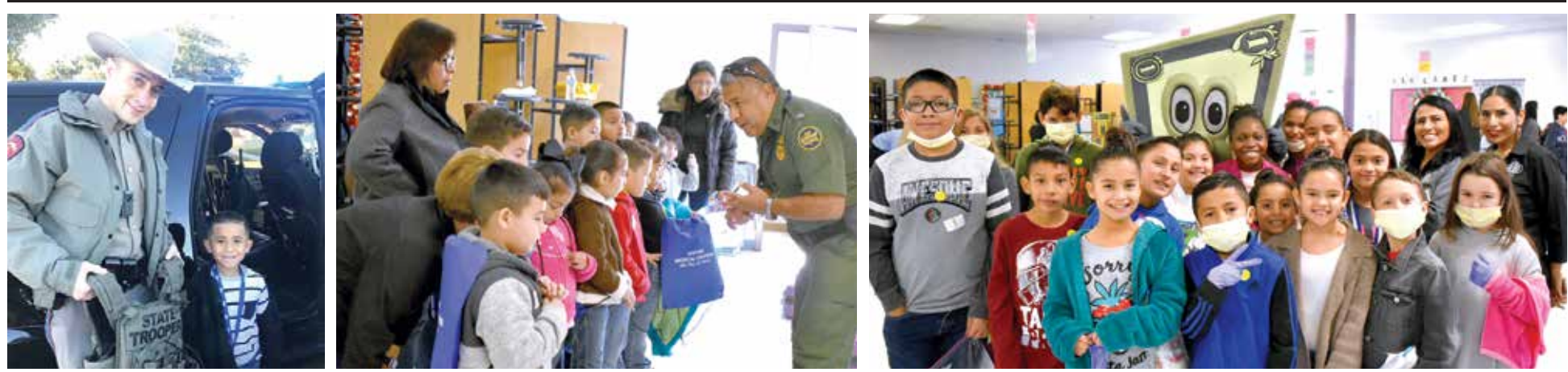
Students were able to visit with many different profession representatives during our annual Career Fair. A big favorite is always our law enforcement booths. Thank you to all who participated and provided an experience for our students they surely won't forget!