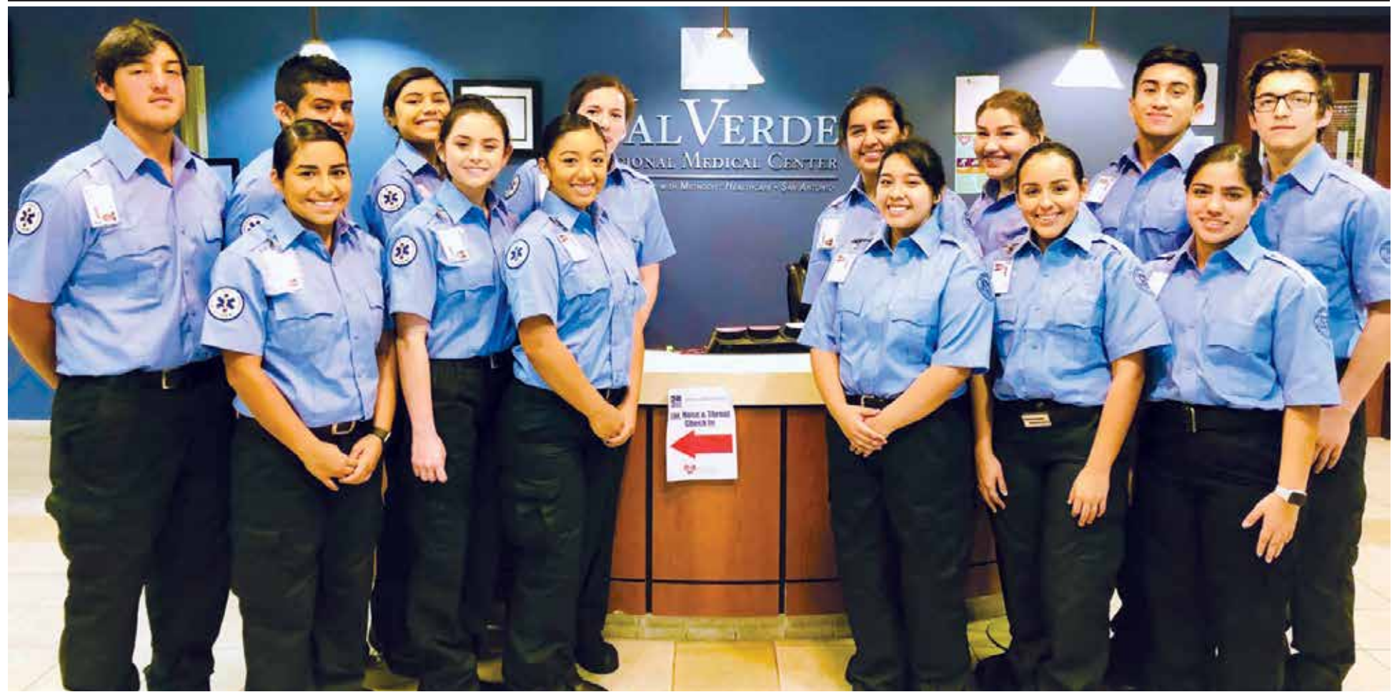
The Del Rio High School EMT students gain hands-on experiences at Val Verde Regional medical center. The training tours they receive greatly benefit their preparation for clinical rotations.