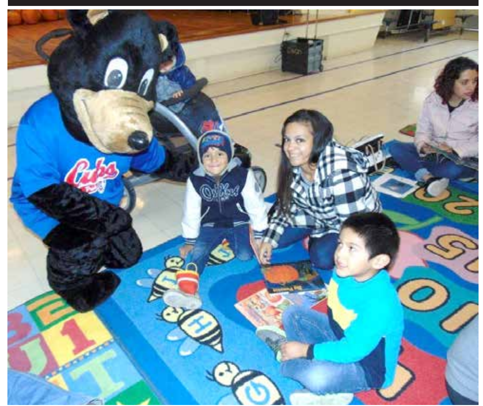
Cardwell families gather in the cafeteria for an evening of reading and learning. Children enjoyed the visit of the Cardwell Cub and nutritious snacks while spending some quality time with their parents. There have been a total of 31,562 books read in the library this school year. Way to go Cubs!