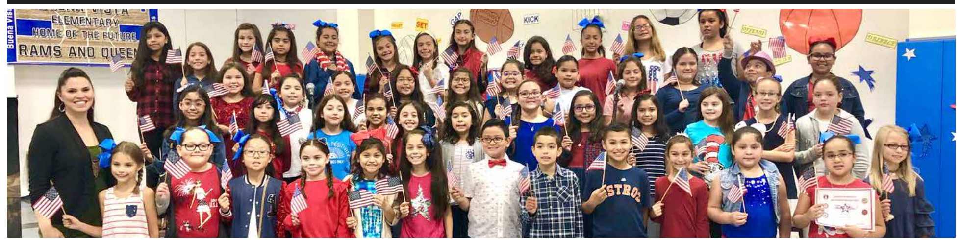
This was definitely a day of honor, to thank and appreciate veterans for their services. The B.V. Choir, Stuco, and Art Academy joined forces to produce a marvelous performance, beautiful artwork, and a breath taking mural.