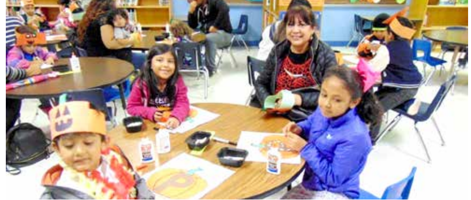
Children, along with their parents, had an opportunity to engage in math, science, literacy, and music learning activities. Parents tooks home activity mats to help their children review concepts learned in class.