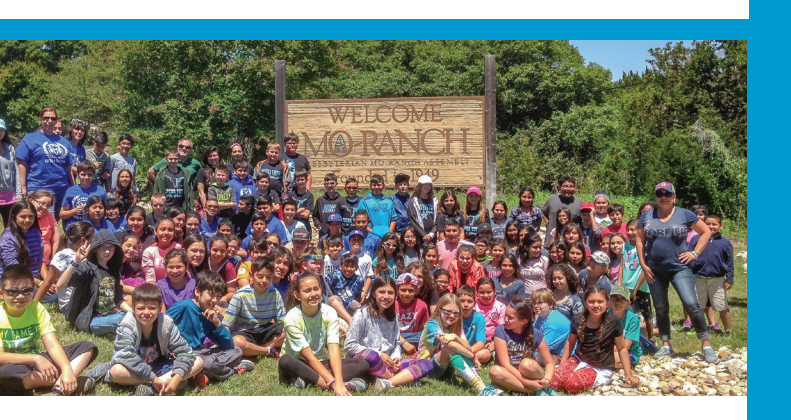
Gifted & Talented

The Blended Academy is a non-traditional campus which serves 8th -12th grade students in a customized, individualized and personalized standards-based instructional environment using multiple models of blended learning. Specially created to provide a learning experience completely different from that provided by traditional means, the Blended Academy targets students who have struggled academically. Smaller classes allow Blended Academy teachers the opportunity to give each student the individual attention that they need. It also makes it possible for teachers to tailor lessons to each student's specific needs. Teachers in these schools employ a wider range of teaching methods to cater to the diverse group of students in their class.