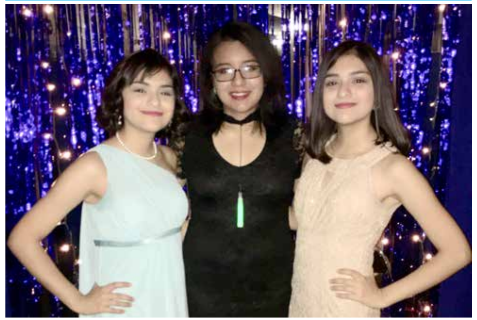
Del Rio High School Student Council held a homecoming dance on November 8th.