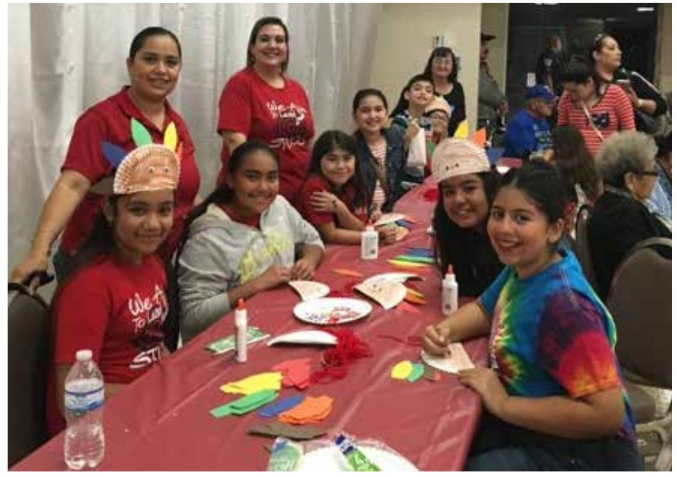
North Heights Elementary StuCo is a team built on service. These past months have been spent logging in community service hours. Pictured are some StuCo members at the Feast of Sharing, where they put together an arts and crafts booth for families to enjoy.