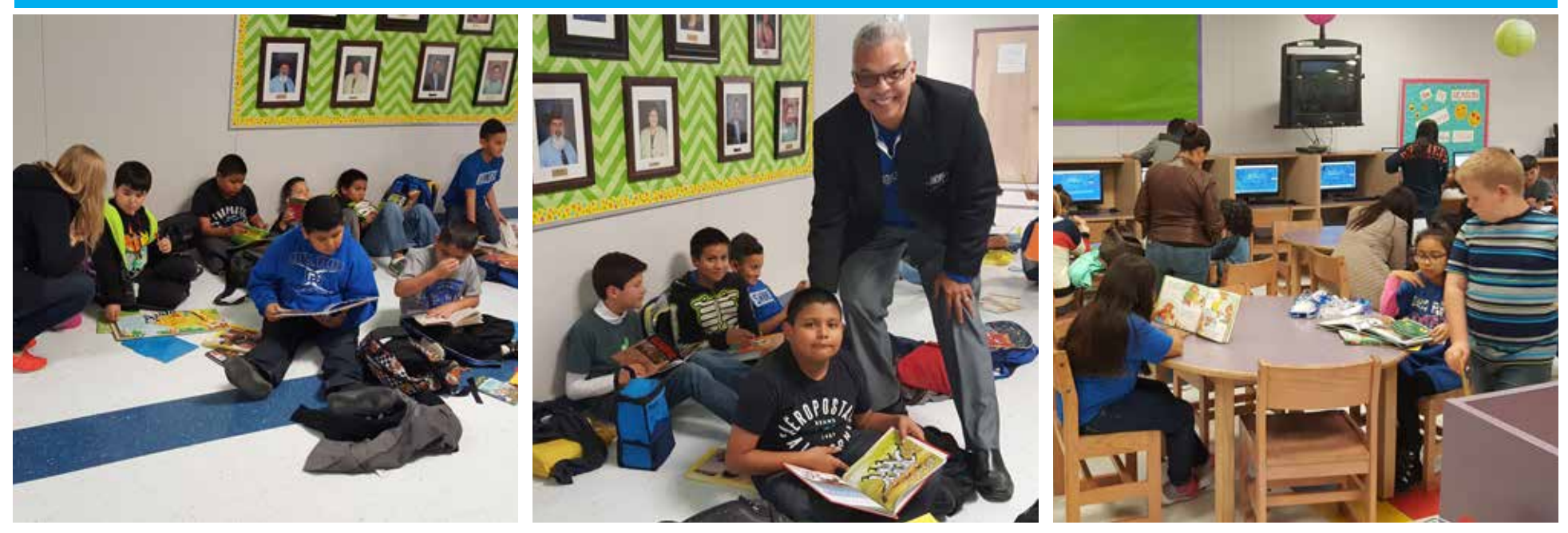
Lonnie Green students love reading so much that they stay after school to participate in our monthly AR Test Fest.