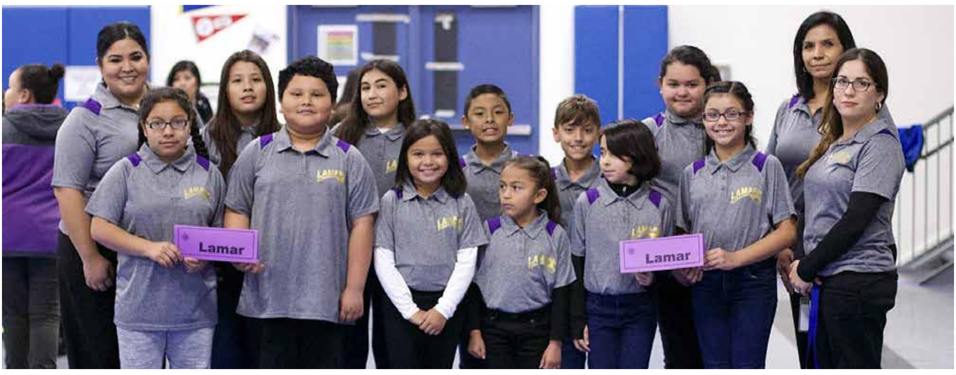
Lamar UIL Ready Writing students competed in the Ready Writing competition. Students work hard each week to refine their writing skills and carry out the new techniques learning in class and in practice. They look forward to seeing how well they faired at the district UIL competition.