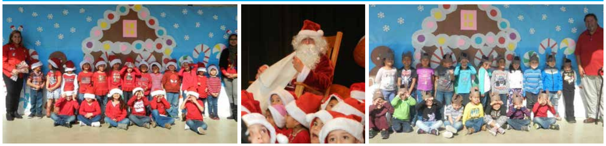
Irene Cardwell Head Start/Pre-K school kicks off the Christmas season with a visit from Santa Claus during the lighting of the tree ceremony.