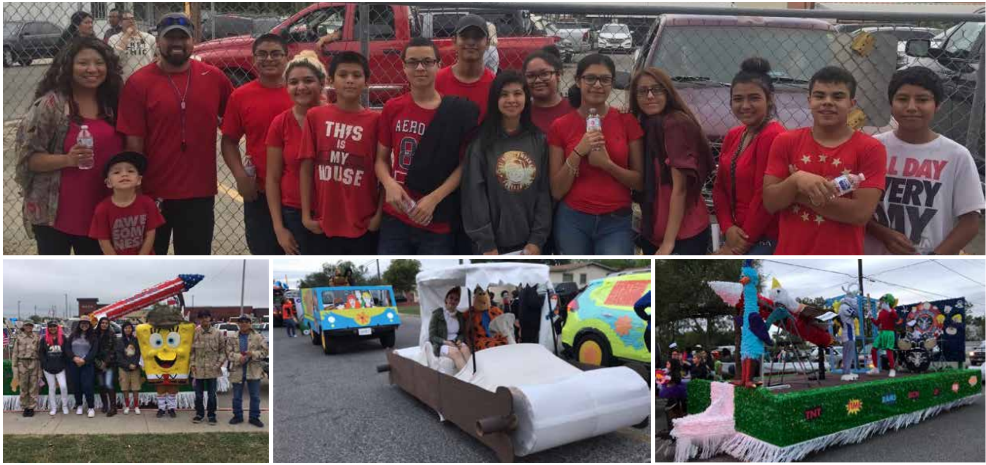
BASAA has not only made a name for their community service, but also for their participation in the parades. Students take pride in what they create and build. They started the year by helping the line-up of the Amistad Parade, in which they said helped them learn to problem-solve and communication. They then dedicated endless hours for their Homecoming Parade, Veteran's Parade and Christmas Parade floats. Although they have been recognized for their work, BASAA prides itself in showing the community their support and love for it by participating and having fun.