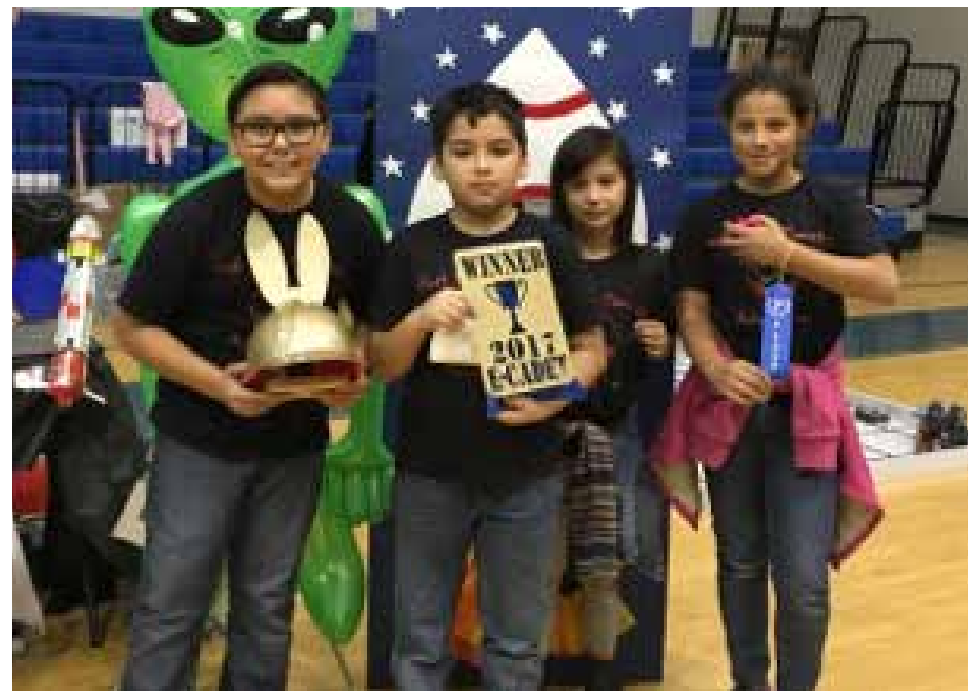
First Runner Up recipients, team Terminators, joined forces with their alli- E-Cadet Champions, team Expertbots, along with their alliance from