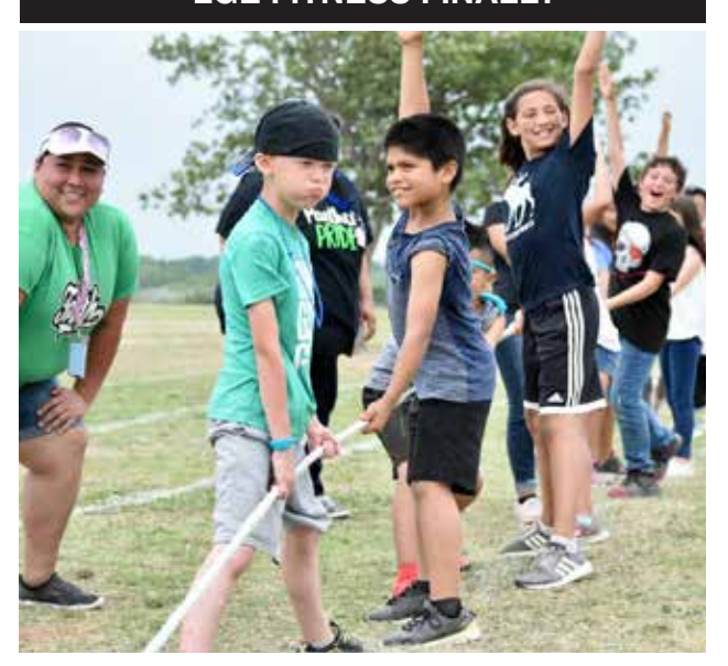
Teamwork is what it is all about! This year's Fitness Finally was a hit!