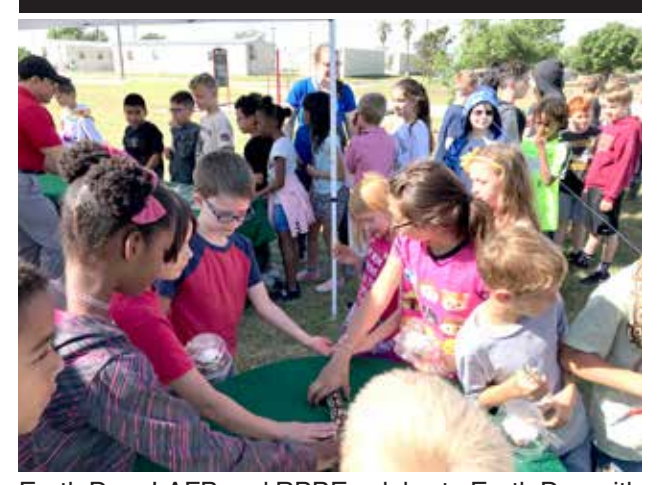
Earth Day- LAFB and RBBE celebrate Earth Day with a tree planting, local wildlife awareness and preservation information.