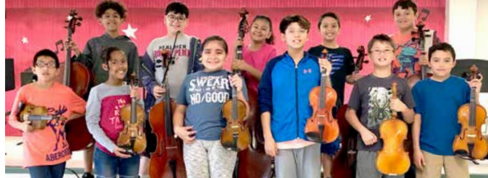
Strings students have been working hard all year long. Great Job, Panthers!