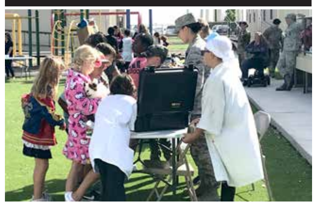
Career Day- LAFB and Del Rio organizations came out for RBBEs 1st annual Career Awareness Day.