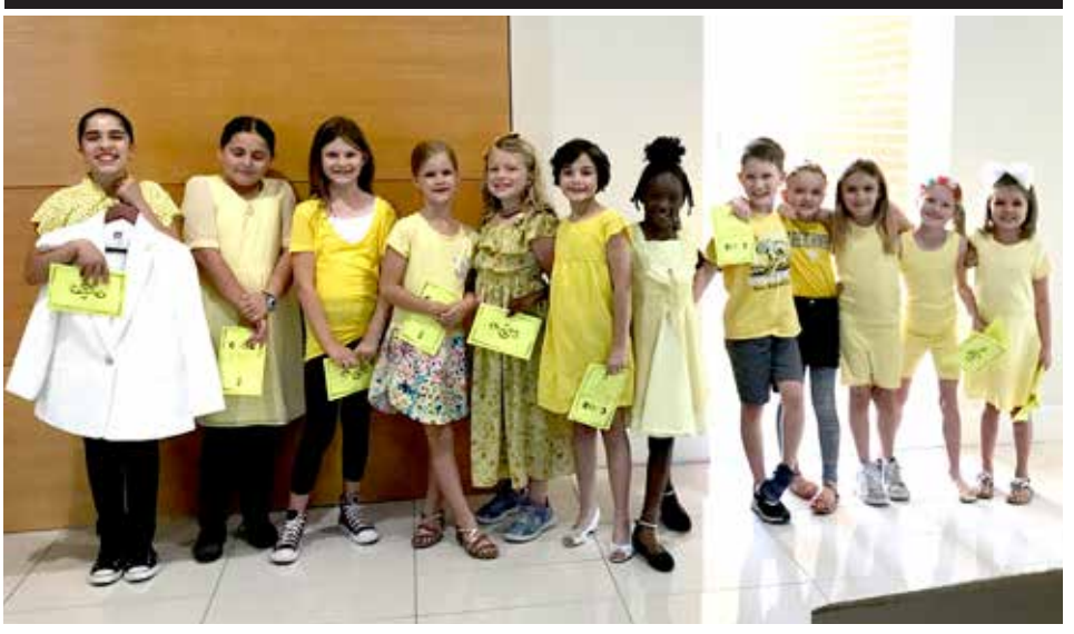
Roberto "Bobby" Barrera Elementary STEM Magnet School Choir performed Yellow Submarine at the Spring Concert.