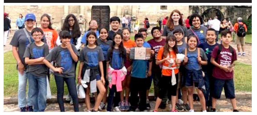
Garfield Student Council enjoyed their outing to San Antonio, Texas visiting the Natural Bridge Caverns, eating at the Rainforest Café and last but not least touring the Alamo.