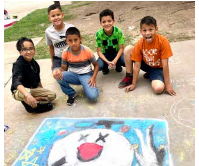
Chalk Fest 2019 was a huge success! Students were able to display their artwork for all to see. We sure do have some talented artist among us!