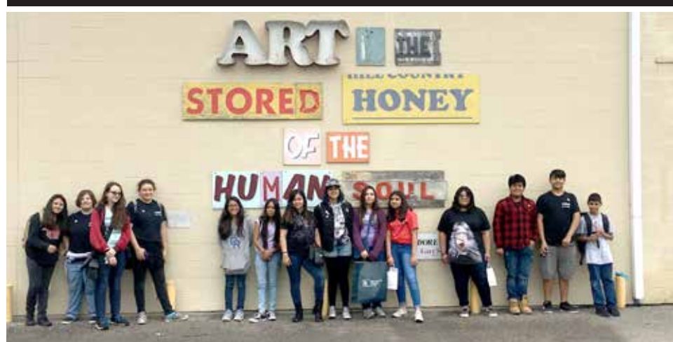
The Del Rio Middle School Art Club attended a field trip in San Antonio, Texas on May 18th. They visited the San Antonio Art Museum and San Antonio Central Library.