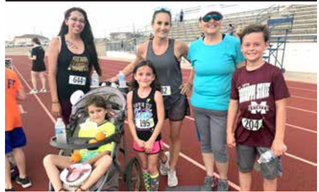
Students, teachers and parents came out to support the RBBE teachers at the I Love My Teacher 5K.