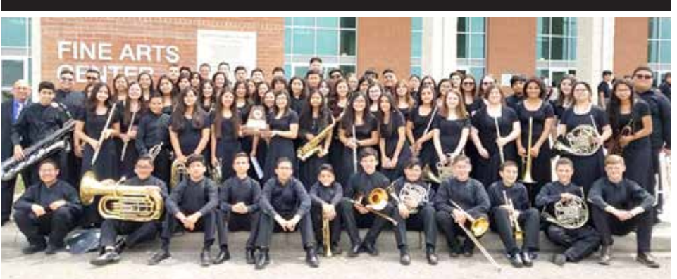
Del Rio Middle School Symphonic Band competed on April 16th in Eagle Pass, Texas and received a sweepstakes rating.