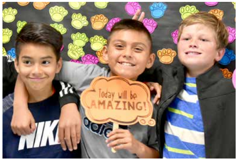
Students pledged to do their best on their upcoming STAAR tests! Go, Panthers!