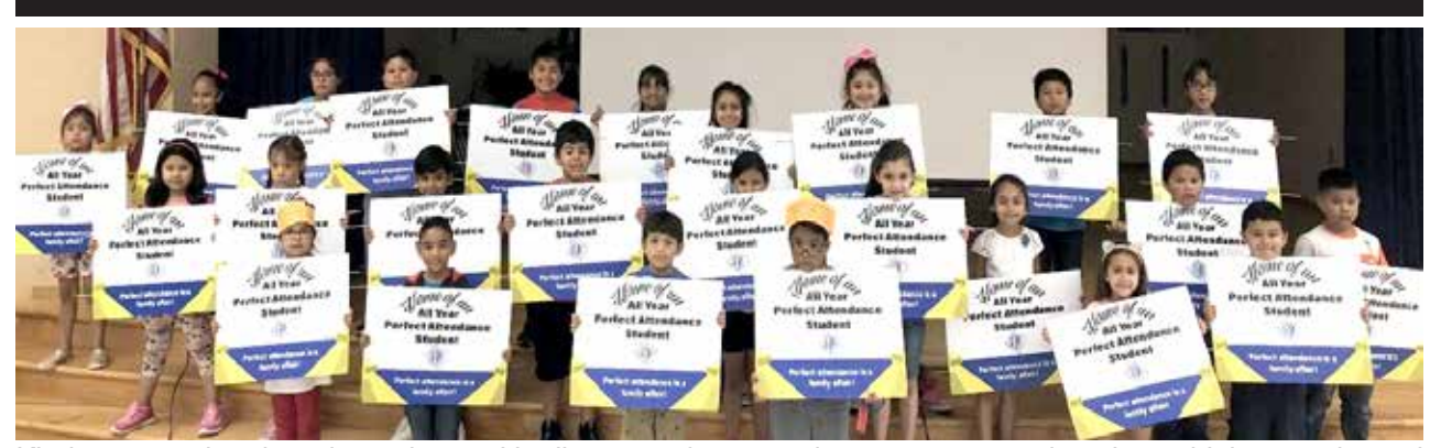
Kinder, 1st and 2nd grade students with all year perfect attendance were treated to pizza, drinks, snacks and a yard sign they may proudly display. We are proud of your accomplishment!!!