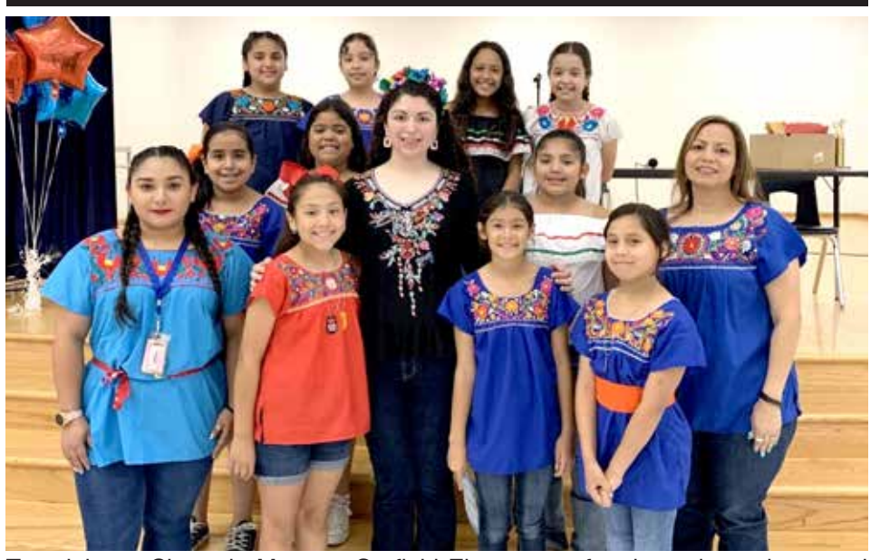
To celebrate Cinco de Mayo at Garfield Elementary, fourth grade students and staff dressed with brightly colored tops and dresses to observe the occasion.