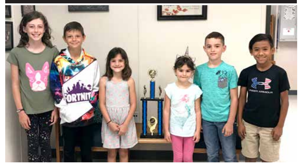
Roberto "Bobby" Barrera Elementary STEM Magnet School won 1st place at the Elementary Track Meet for Small School Participation, all students placing in their races.