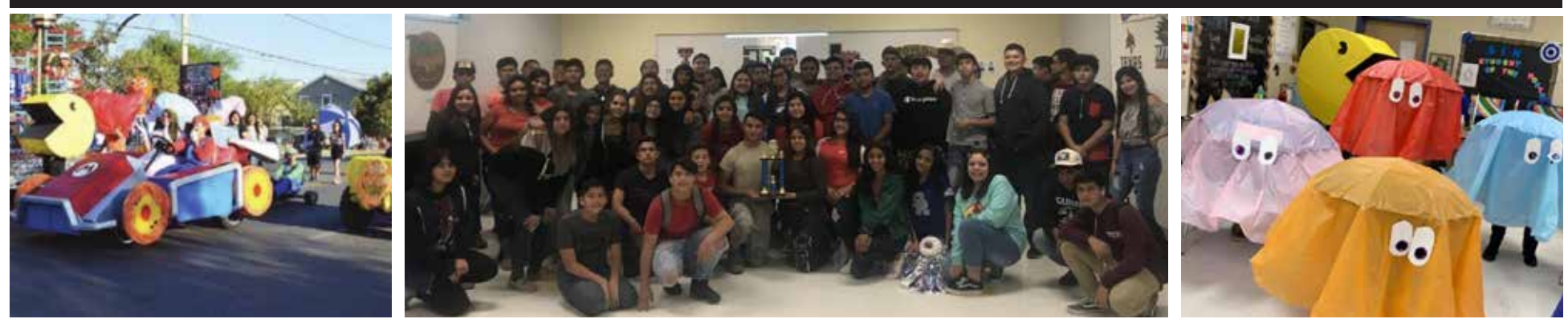
The annual homecoming float is a representation of what Blended Academy stands for. We are in it to win it every day. Students, parents and staff blended their creativity and hard work to create the first place entry in two days.