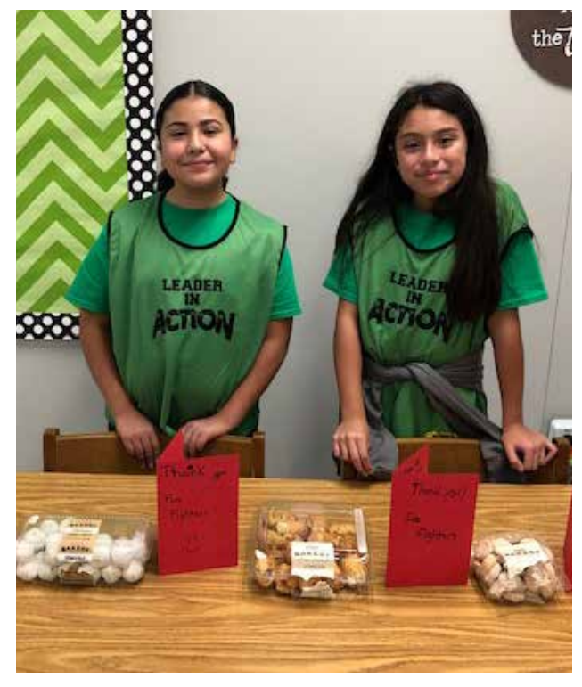
StuCo officers - Our wonderful Student Council Officers thanked local Firefighters during our Fire Prevention Program for K-2 students.