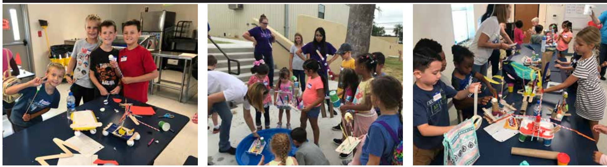
July STEM Camp 2019- Sixty five new and returning students at Roberto "Bobby" Barrera Elementary attended a 2 day camp to learn about STEM.