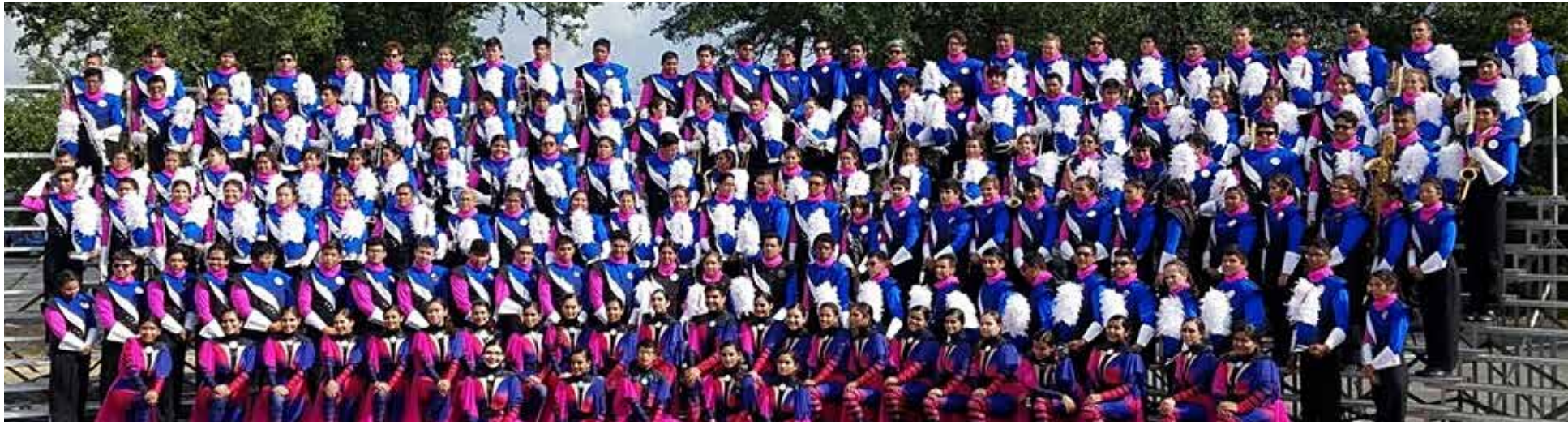
The DRHS Mighty Ram Band has been a finalist in two Bands of America Regional Contests this school year. The band placed 8th in the Bands of America McAllen Regional Finals and placed 7th at the Bands of America Midland Regional Finals.