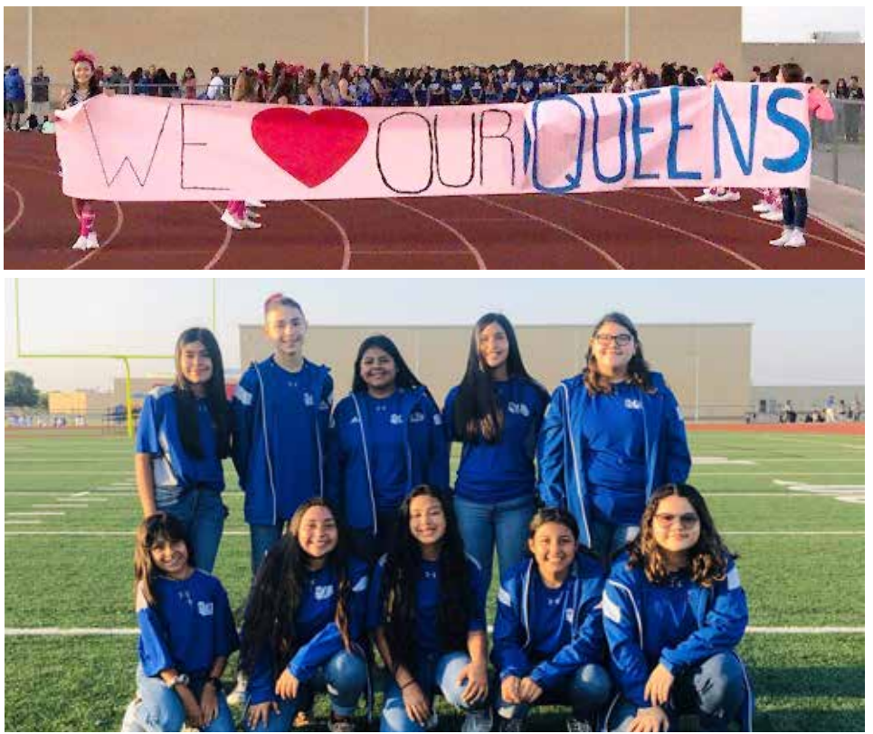
On October 8th, DRMS held a pep rally for all fall sports and a farewell and good luck on their upcoming games! We recognized the boys 7th and 8th grade Football, Cross Country, and girls Volleyball team.

The 8th grade volleyball team (blue) won their first tournament of the season on September 7th. They played again 4 other teams. The 8th grade volleyball team continues to play hard this season.