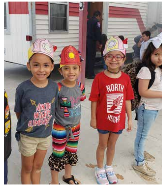
Students at North Heights Elementary participated in a Fire Prevention Week presentation by the Del Rio Fire Department.