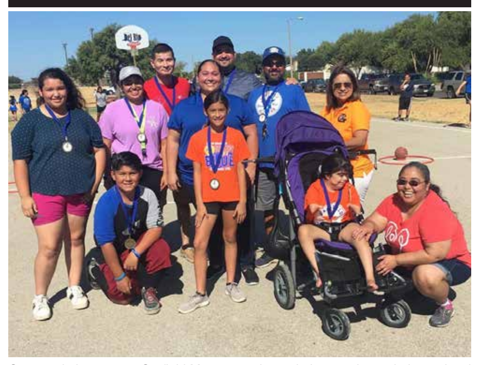
Congratulations to our Garfield Mustangs who took the 1st place win in our local Andale Del Rio Shoot Out competition. Thank you students, parents, coaches, and staff who participated in making our victory win!