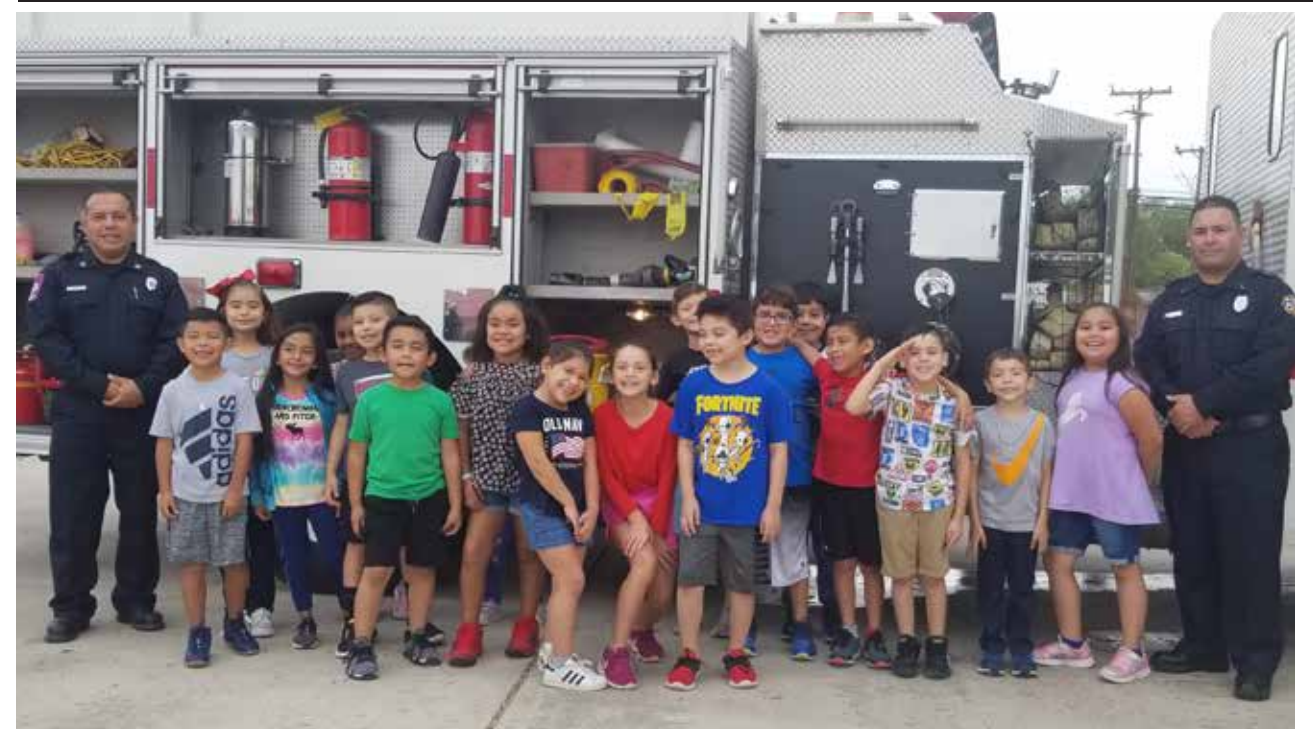
Be alert and prevent fires! The Fire Department along with Sparky visited North Heights Elementary on Thursday, October 3rd to educate the students about the small but important actions they can take to keep themselves and those around them safe from a fire.