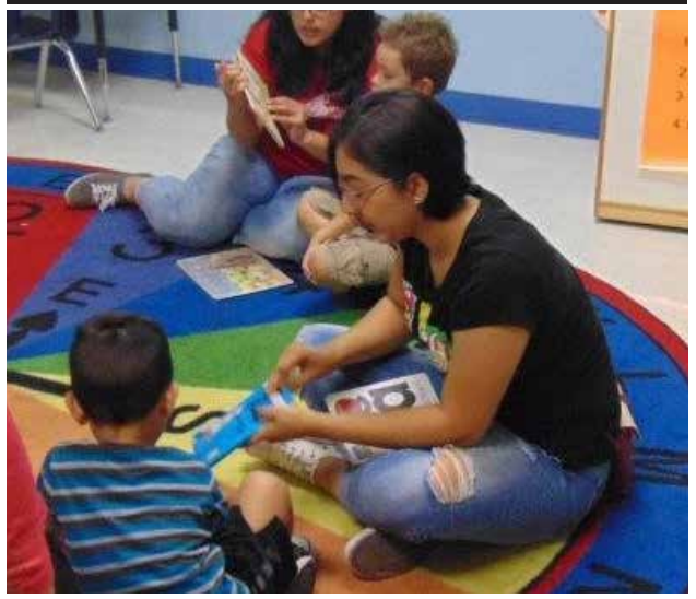
Cardwell kicked off this year's Families Reading Together afterschool program. Numerous families gathered to read and create a home library out of a cardboard box. Reading has never so much fun!