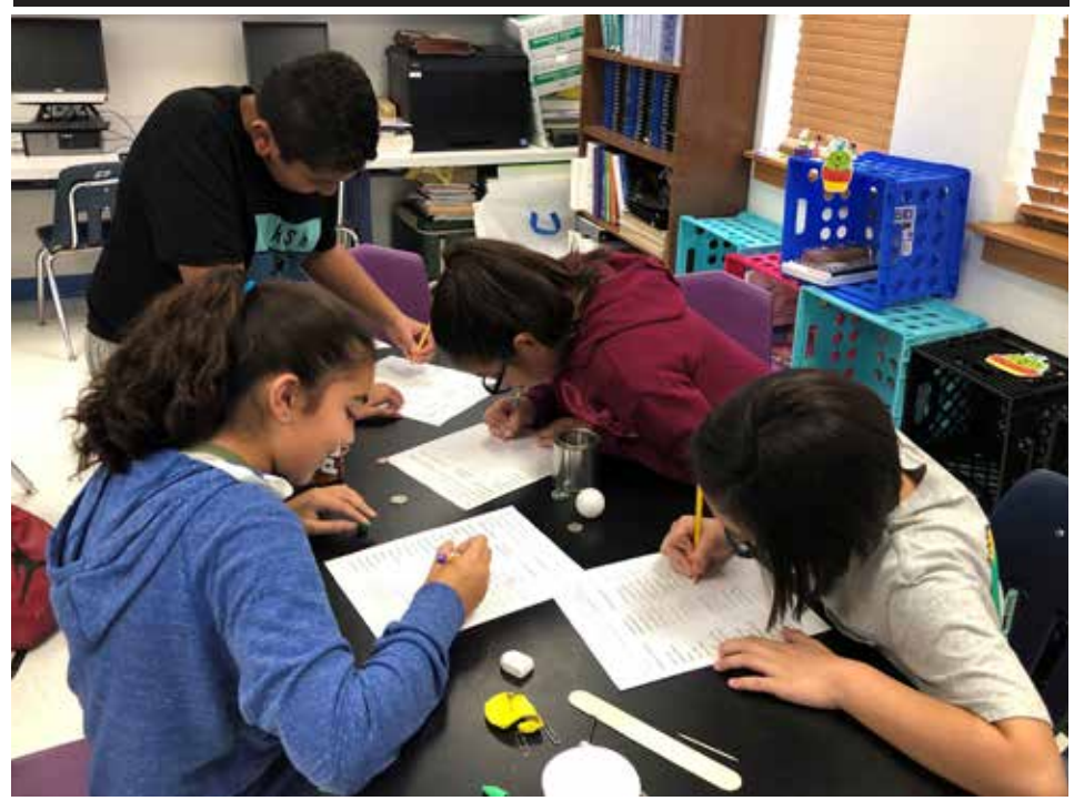
Students in Mrs. P. Villarreal's 5th grade science class recently participated in a lab to explore conductors and insulators. Through hands-on experiences students were to determine if items provided to them were conductors of electrical currents.