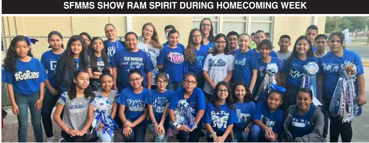
The students and staff at San Felipe Memorial Middle School showed their Ram Spirit during Homecoming Week. From "pajama day" to "trend day", Team SFMMS showed their pride and their support for the Del Rio Rams. Go, Rams, Go!