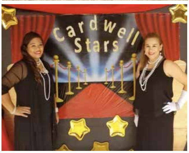
In an effort to instill the importance of school attendance, the Cardwell Zero Absence Day Committee provided students and parents an opportunity to take a Hollywood style family portrait prior to the start of the day. Everyone dressed in their Sunday best and created beautiful memories.