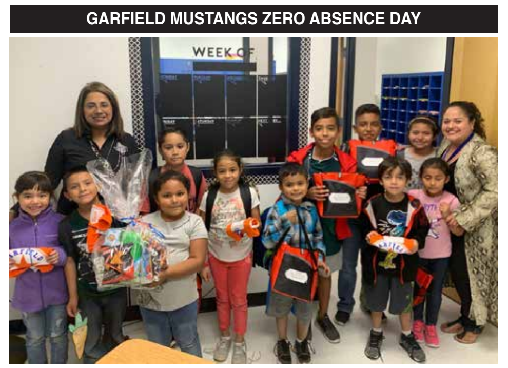
Congratulations to our Garfield Mustangs who were present on Zero Absence Day. These students were awarded a special prize to show their dedication and presence for being at school. Attendance Matters!!!! Attend TODAY and ACHIEVE Tomorrow!!!!

The 8th grade volleyball team (blue) won their first tournament of the season on September 7th. They played again 4 other teams. The 8th grade volleyball team continues to play hard this season.