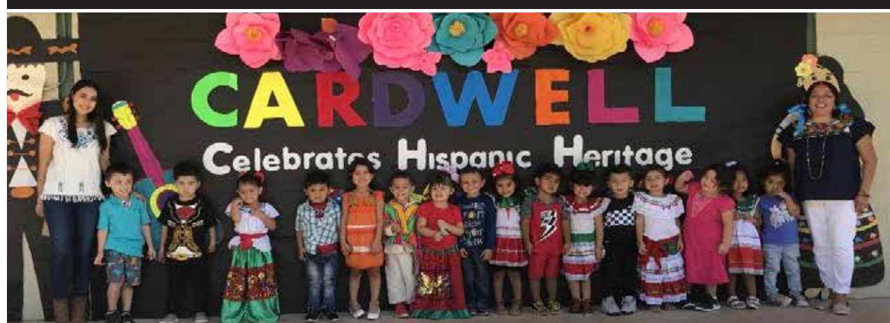
Students and staff dressed up in traditional cultural attire to learn about different cultures and celebrate diversity.

AMIGO DENTISTRY STAFF & MR. TOOTH VISIT CARDWELL