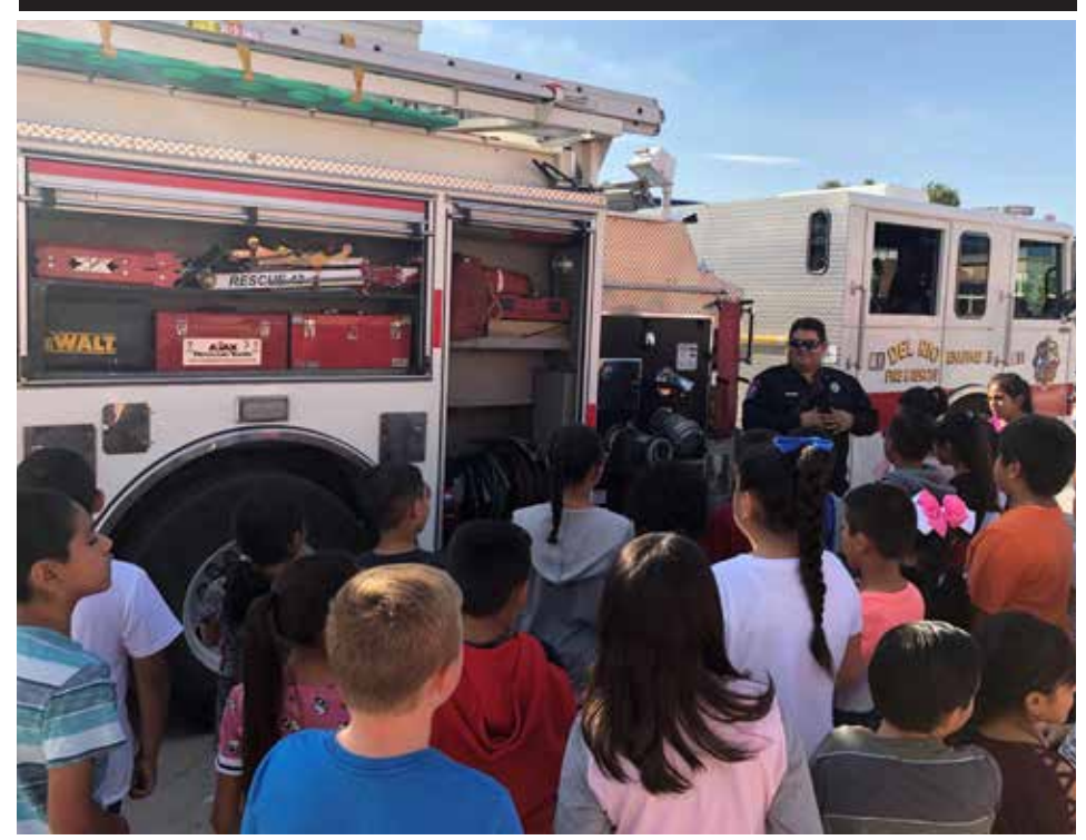
Students at Lamar Elementary had some special guests on Tuesday, October 15th. Members of the Del Rio Fire Department and Sparky were on hand to give lessons to students in fire prevention and fire safety.