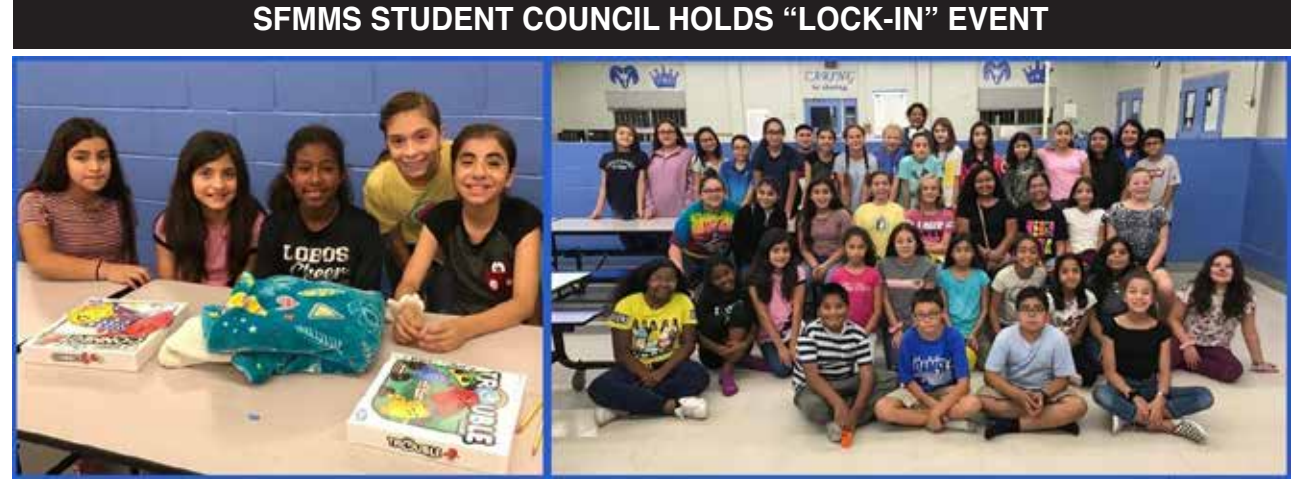
The SFMMS Student Council held a "lock-in" on Friday, September 20th. This team-building event was full of activities, encouraging students and sponsors to interact more with each other on a social level and foster school spirit.