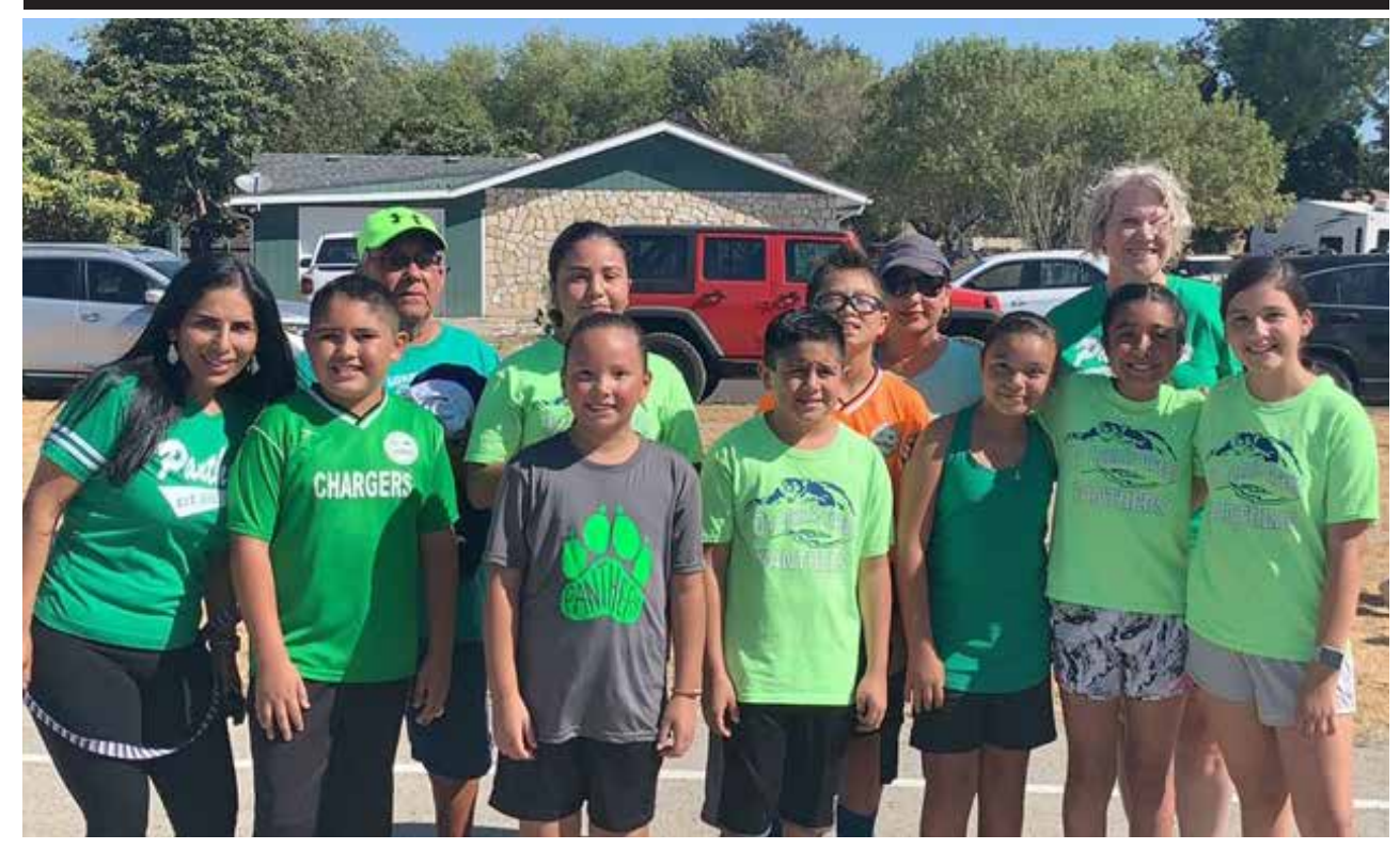
Andale, Del Rio - 4th and 5th grade students enjoyed some friendly competition against other SFDRCISD Elementary Schools at the citywide Andale, Del Rio Event Saturday, October 5th.