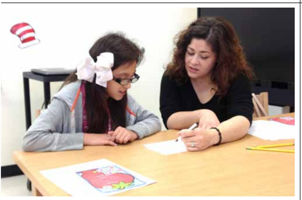
Ruben Chavira Elementary School Teams Up With Sul Ross University

Parents are an extremely important part of the school culture at RCE. The school is proud to have a group of almost 20 parents who consistently volunteer their time and talents at the school to enrich lessons and assist teachers. Parent volunteers meet in the resource room and assist teachers with lessons, activities, and other classroom preparations. The teachers and students appreciate these parents and all that they do to help our school!