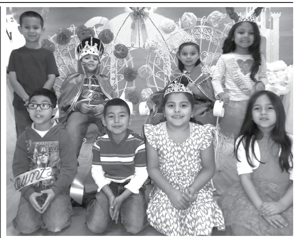
Kindergarten Valentine's King & Queen Coronation

Students at Garfield Elementary attend physical education classes three times per week for forty-five minutes. During the physical education class, students participate in rigorous physical activity that is aligned to their learning target. Units of study in physical education include: football, basketball, tennis, volleyball, softball, running and conditioning, and dance. Along with physical activity, students are asked guiding questions to promote critical thinking about their fitness and health. The activities that students participate in during physical education also prepare them for the state Fitness-Gram assessment. The Fitness-Gram assessment requires students to work at different centers on physical assessments such as: curl-ups, pushups, stretches, trunk lift, shoulder stretch and a one mile walk/run.