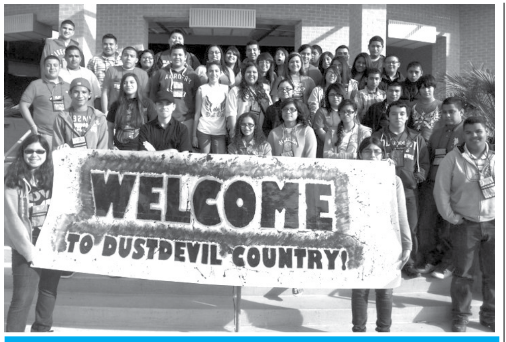
Freshman Students Preparing for College

This past February, a group of Freshman students participated in a college tour at Texas A&M International University (TAMIU) in Laredo. This trip was sponsored by the GEAR UP program. Upon arrival to the campus, the university's greeting committee welcomed the students with a Texas sized banner. The students enjoyed several fun activities related to college readiness, study abroad programs, and the campus organizations. The planetarium on campus presented a 3D galaxy show. Students also enjoyed a tour of Laredo's Center of the Arts and Webb County Heritage Museum.