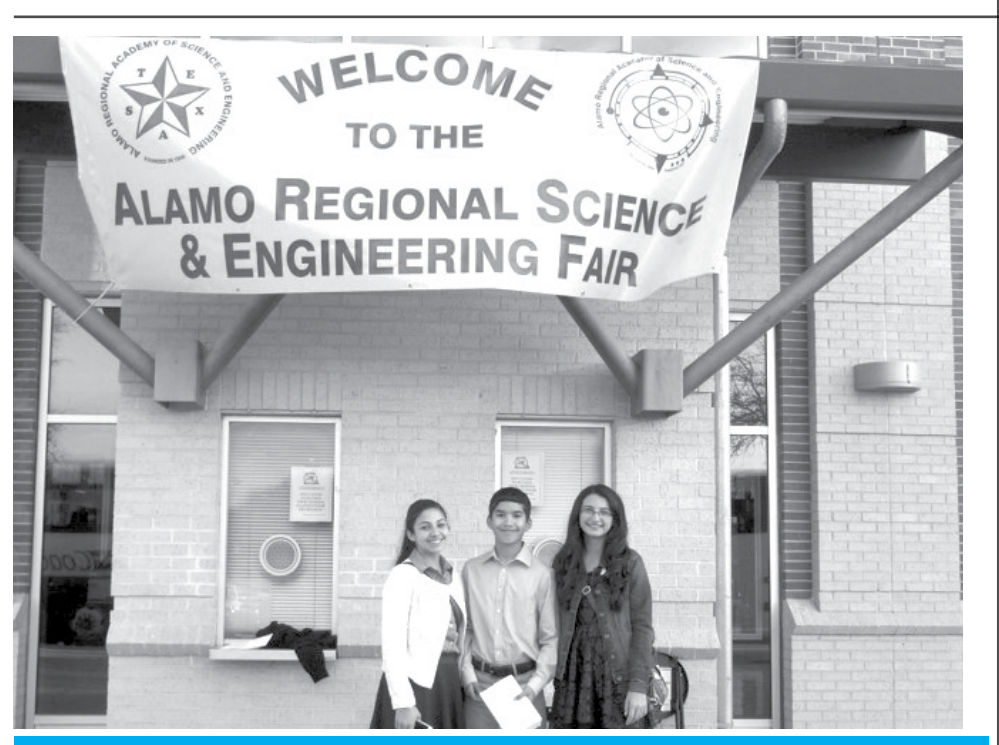
Freshman Students at Regional Science Fair

This past February, a group of Freshman students participated in a college tour at Texas A&M International University (TAMIU) in Laredo. This trip was sponsored by the GEAR UP program. Upon arrival to the campus, the university's greeting committee welcomed the students with a Texas sized banner. The students enjoyed several fun activities related to college readiness, study abroad programs, and the campus organizations. The planetarium on campus presented a 3D galaxy show. Students also enjoyed a tour of Laredo's Center of the Arts and Webb County Heritage Museum.