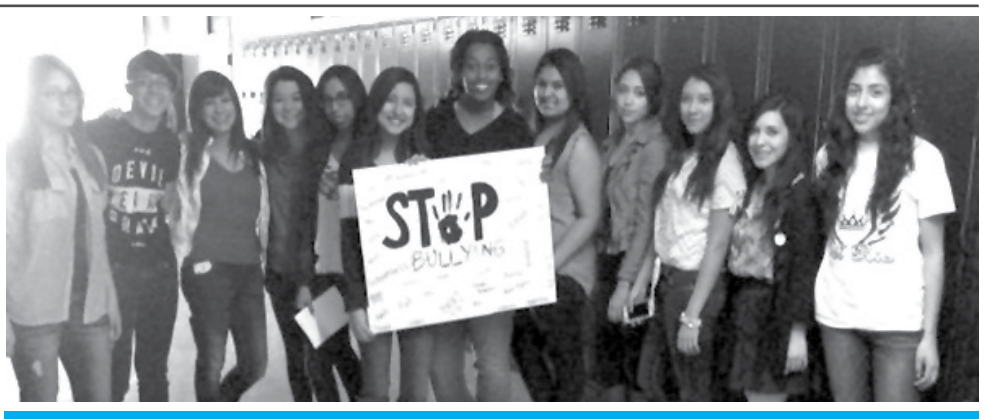
Freshman FCCLA Members in Action