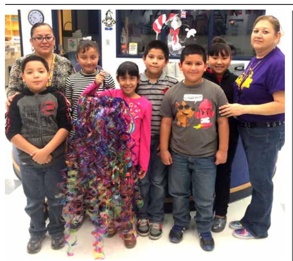
3rd grade students donate a recycling project to the Lamar Elementary Library.