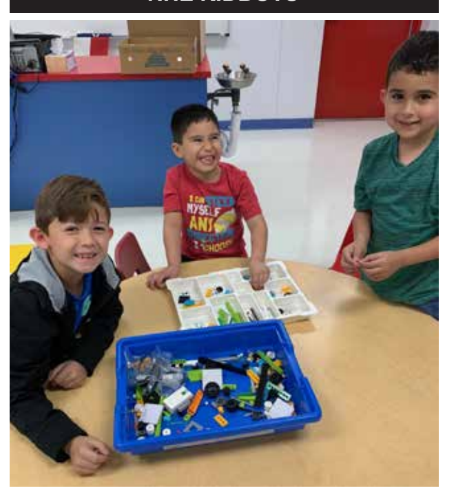
Kidbots started at North Heights Elementary!! The Kidbots program will allow students in Kinder, First and Second grades to gain exposure to the robotics world wherein a foundation in STEM courses will be built.