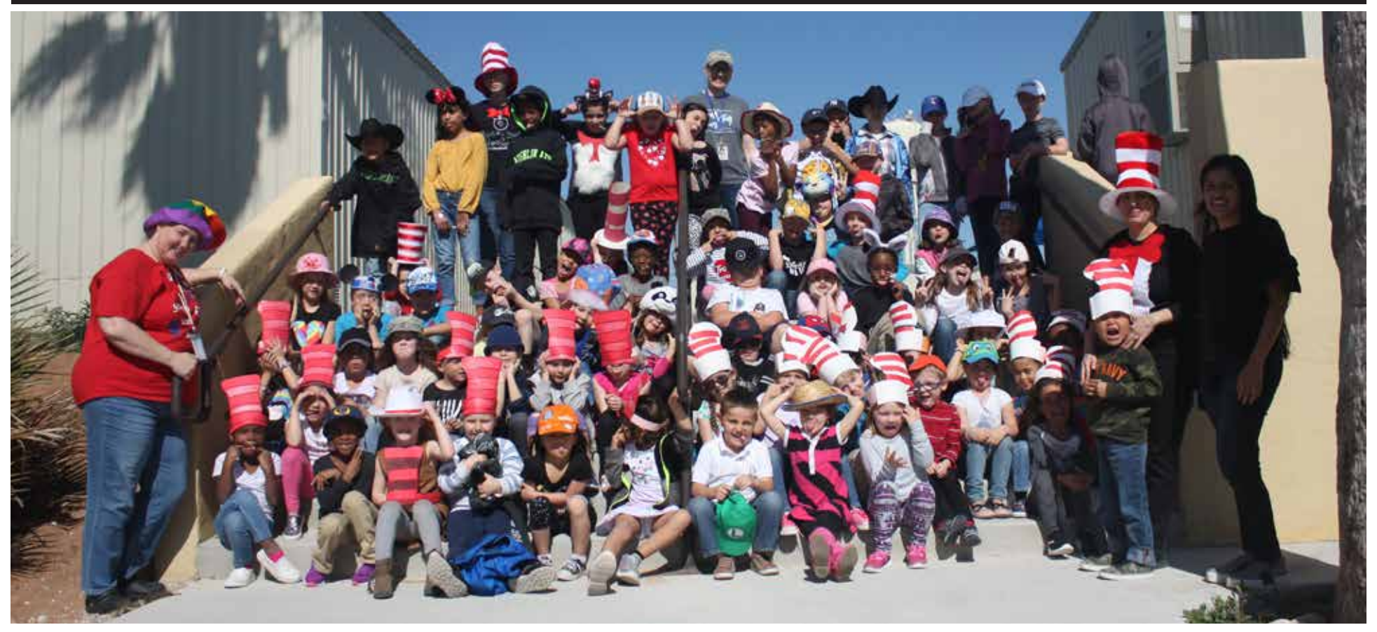
LAFB Barrera STEM Magnet celebrated Read Across America Week with Hat Day.