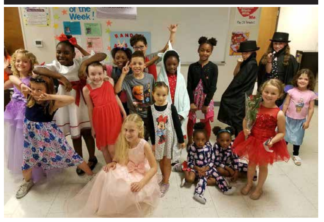
On February 28th LAFB Barrera STEM Magnet had their 1st Annual Talent Show with performers ranging from Pre-K thru 5th grade.