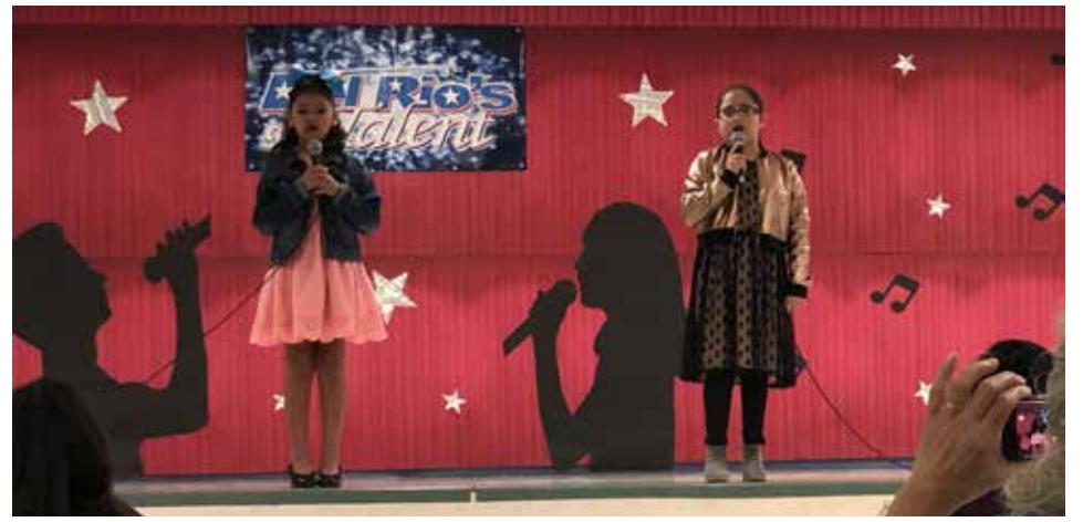
Students performed at this year's Talent Show which showcased many of our talented students! Winners will proceed to compete at the upcoming District Talent Show! Good luck, Panthers!!!