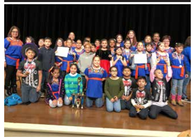
Garfield Elementary placed 3rd overall in the District UIL Meet in December. We are very proud of all the hard work and dedication of our Garfield Students