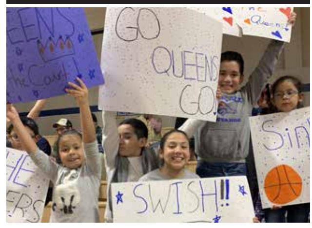
Garfield Students helped celebrate our Queen's Basketball Team January 31st and watched them win BIG over their opponent.