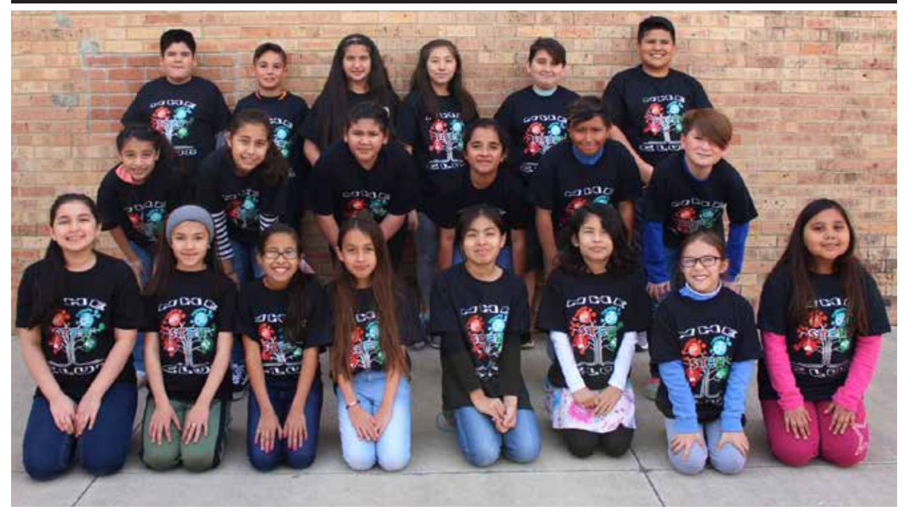
NHE STEM Club provides a variety of fun, challenging activities for students to extend their learning of Science, Technology, Engineering, and Mathematics from the classroom. STEM club is available to fourth and fifth grade students.