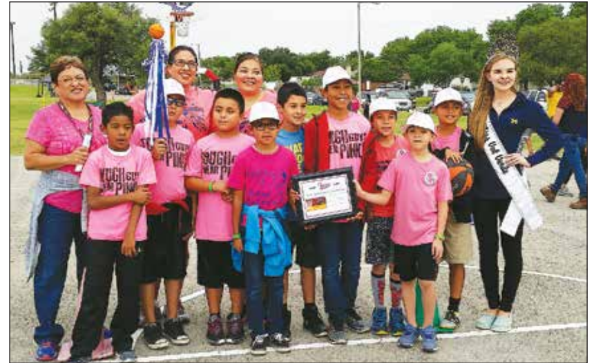
Dr. Fermin Calderon Elementary third grade students participated in the annual Andale Del Rio physical challenge on Saturday, October 1, 2016. The community has this health fair and family run/walk annually and invites the elementary campuses of our district to be a part of it. This year DFC placed third place in the competition that involved demonstration in basketball skills, accuracy and speed.