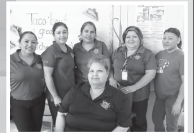
Cardwell custodial and cafeteria staff get recognition for their hard work and dedication.