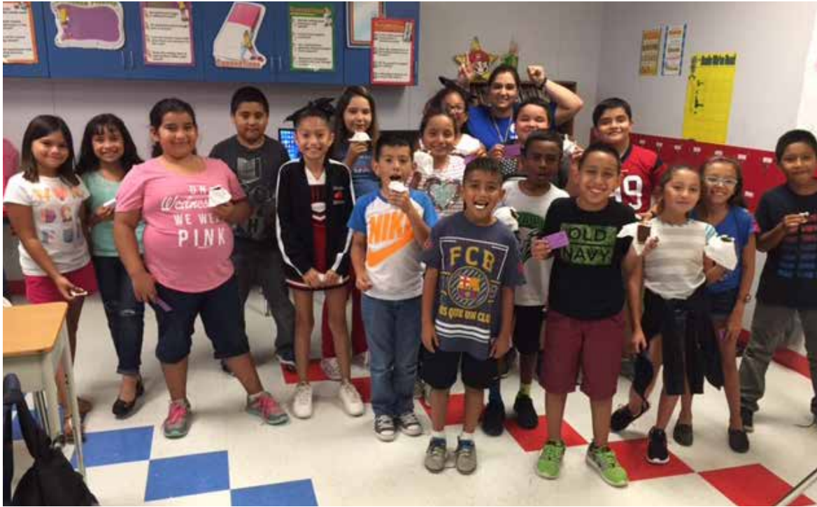
Miss Solis's 4th grade class celebrated 20 consecutive days of Perfect Attendance. They were rewarded with a refreshing treat.