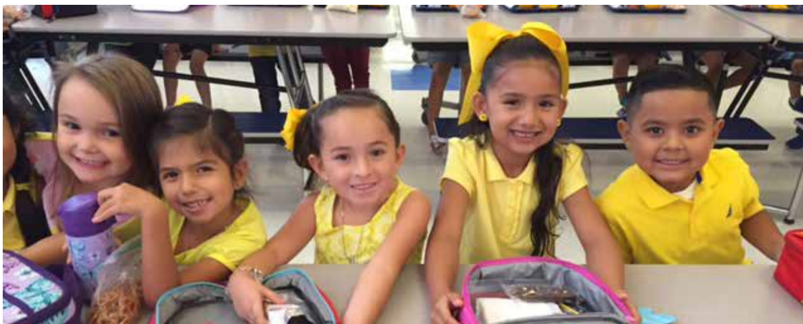
During the 1st six weeks of school NHE Kindergarteners learned about colors. One of the activities during this unit of study was wearing the color of the day.