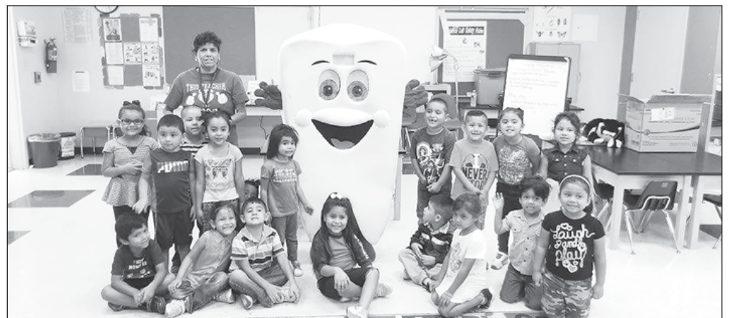
Staff members of Amigo Dentistry and Amigo Mascot teach Cardwell students how to care for their teeth.