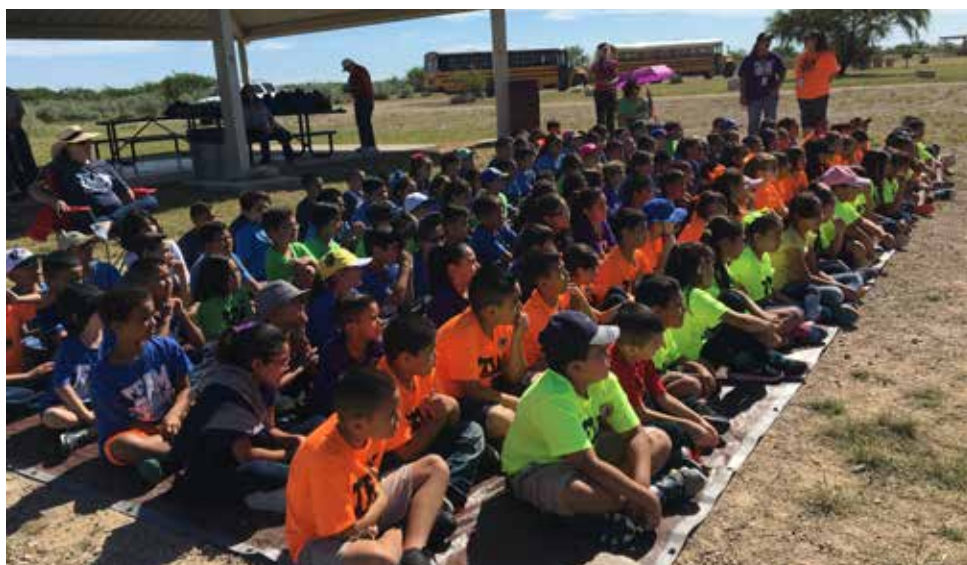
Bird of Prey – Garfield's 3rd graders got to see nature up close and personal during the Birds of Prey presentation given by the National Park Service. The students had a fabulous time learning about different birds and what kind of prey they hunt.