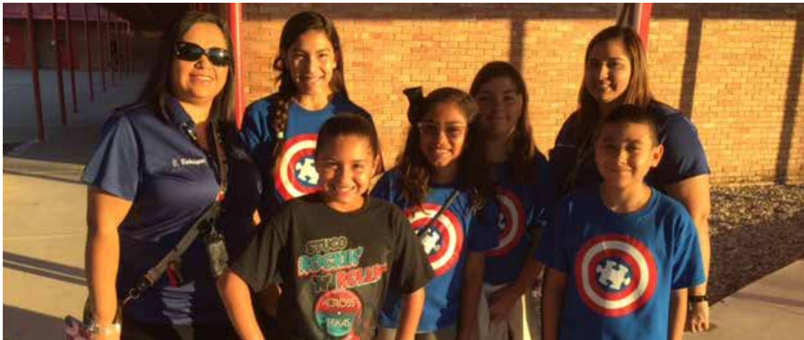
Student Council Officers attended and participated in a leadership workshop presented by Leaders R Us, at the Civic Center in September.