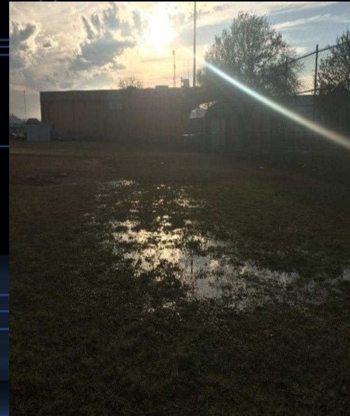
Softball Batting Cage