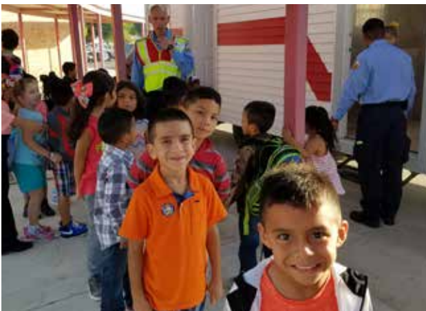
NHE Students participated in a Fire Prevention presentation presented by the Del Rio Fire Department on Wednesday, October 10th for Fire Prevention Week.