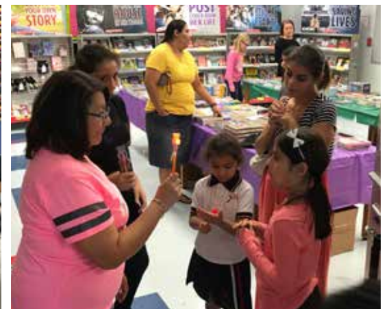
OPEN HOUSE was on Wednesday, October 3, 2018 and we had a wonderful turnout. We also had great support at our Book Fair in the library. Students received their 1st six weeks report card and a lot of important information. Our hallways were full of many happy parents and students.