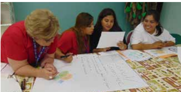
Members of the Policy Council and Governing Body participated in a workshop to learn about Head Start Performance Standards and their duties and responsibilities as committee members.