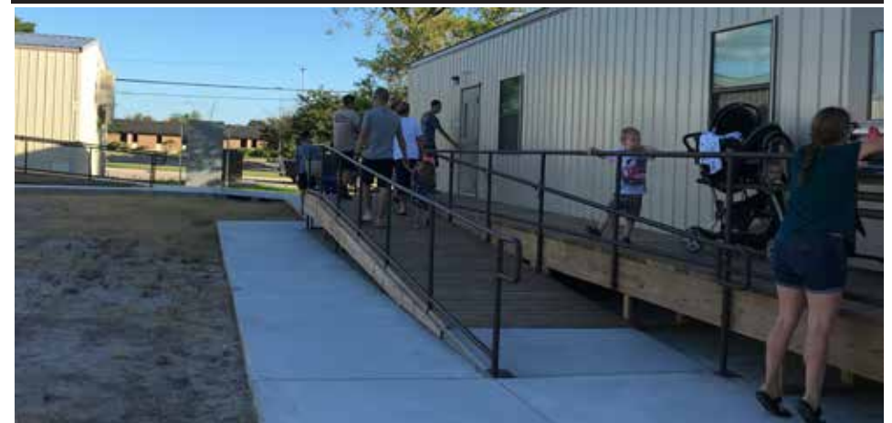
Our Inaugural Open House and Book Fair Oct. 4