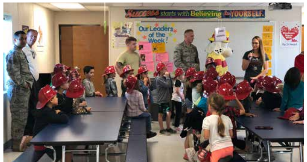
Laughlin AFB Fire Department presenting to the students for Fire Prevention Week Oct. 10