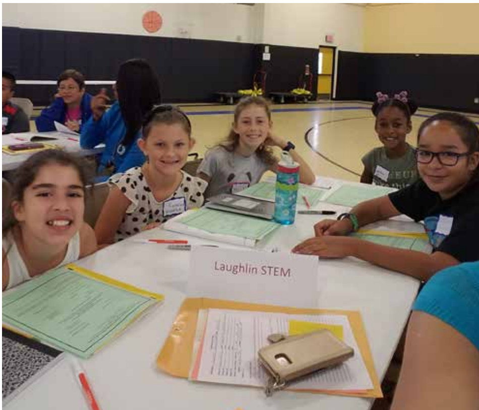
Newly elected Student Council Officers from Laughlin Elementary at Leadership Workshop Oct. 2