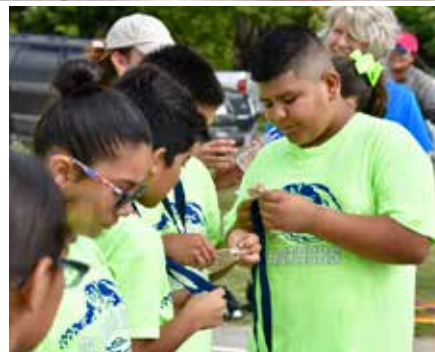
Andale 1-4 & Third Place Team- Dr. Lonnie Green Panthers competed in the annual Andale Del Rio basketball shootout against other elementary schools. Panthers proudly came in 3rd place overall and received medals! Great job, Panthers!