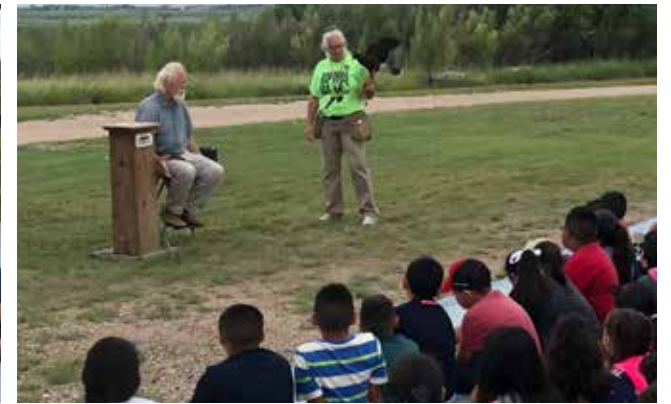
Third graders attended a Birds of Prey presentation presented at the Dr. Alfredo Gutierrez Amphitheater by Amistad National Park Service.