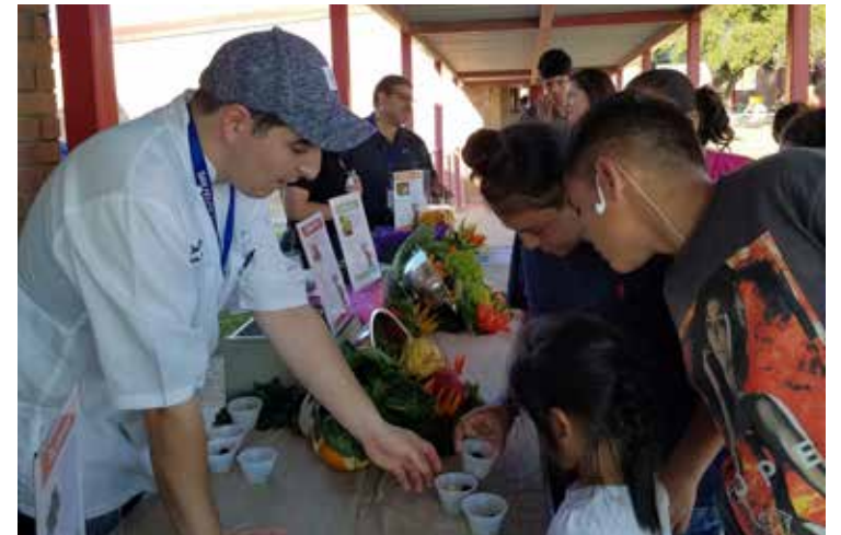
Students and parents joined in on the fun by participating in the Farmer's Market during Open House where they were able to sample new and exciting fruits and veggies.