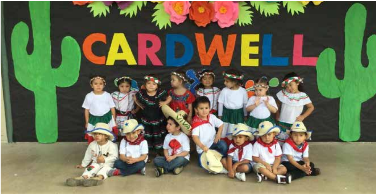
Students and staff dressed up in traditional cultural attire to learn about different cultures and celebrate diversity. With the help of their parents, students created a piñatas which were proudly displayed on campus.