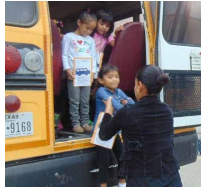
Cardwell students participated in bus evacuation drills and safety lesson during the month of September. Safety is the number one priority at Cardwell Head Start & Pre-K Program.