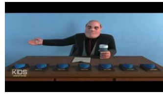
The Meaning of Loyalty