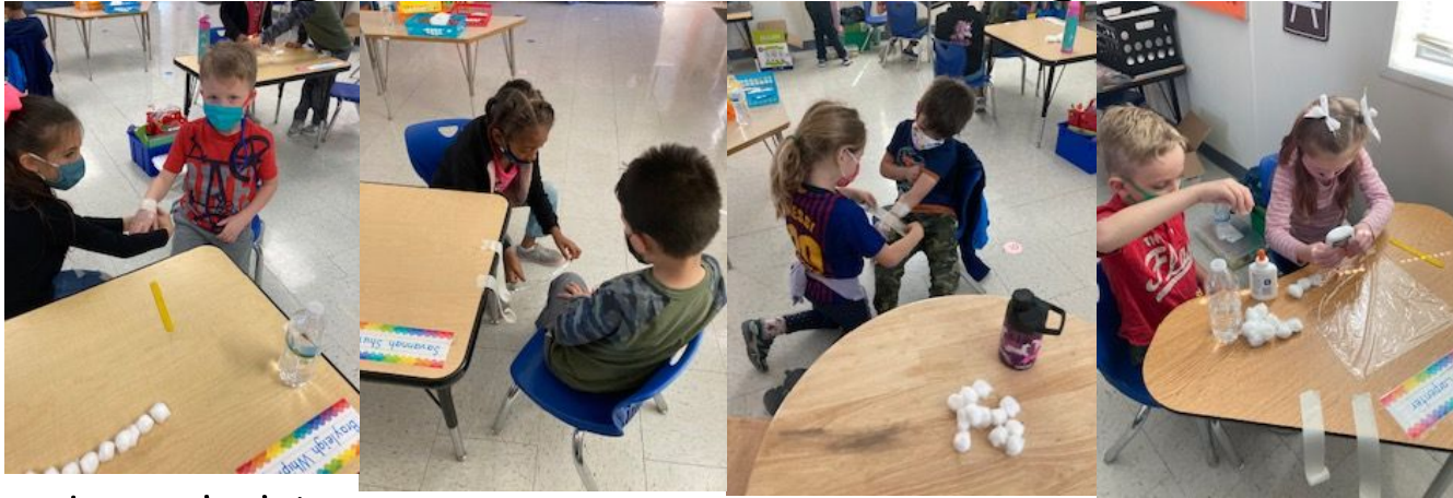
Words By: Brynlee Bingham