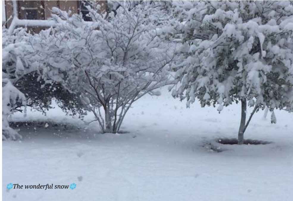
❄️The wonderful snow❄️